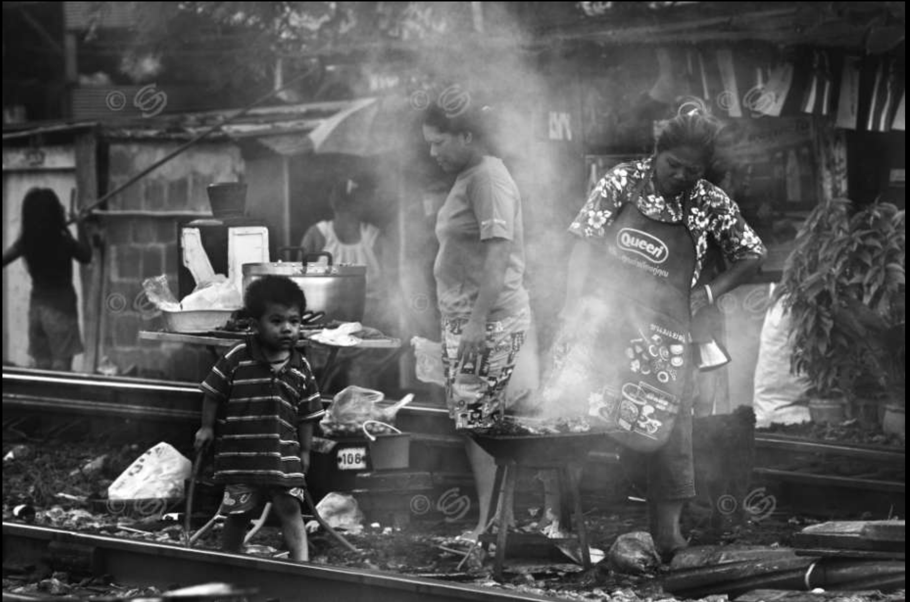
Between the railroad tracks a woman sells chicken skewers in the Bobs area almost in the center of the Thai capital. In total it is estimated that 10% of the Bangkok population living in the slums, although it is not easy to know exactly the number of the people.