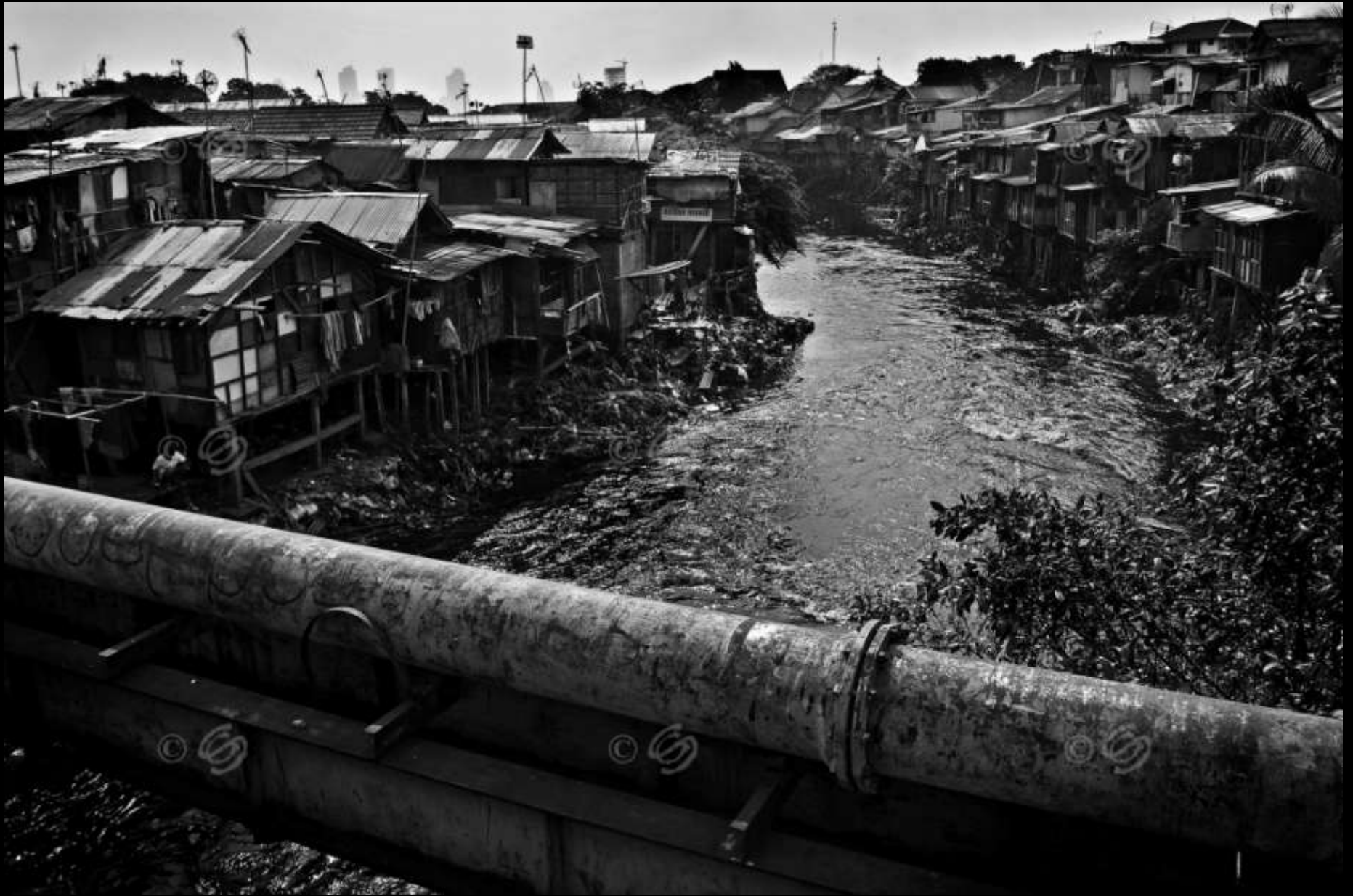
The population density in the Maggarai slum reached impressive levels: an whole city has grown and developed in the heart of Jakarta.