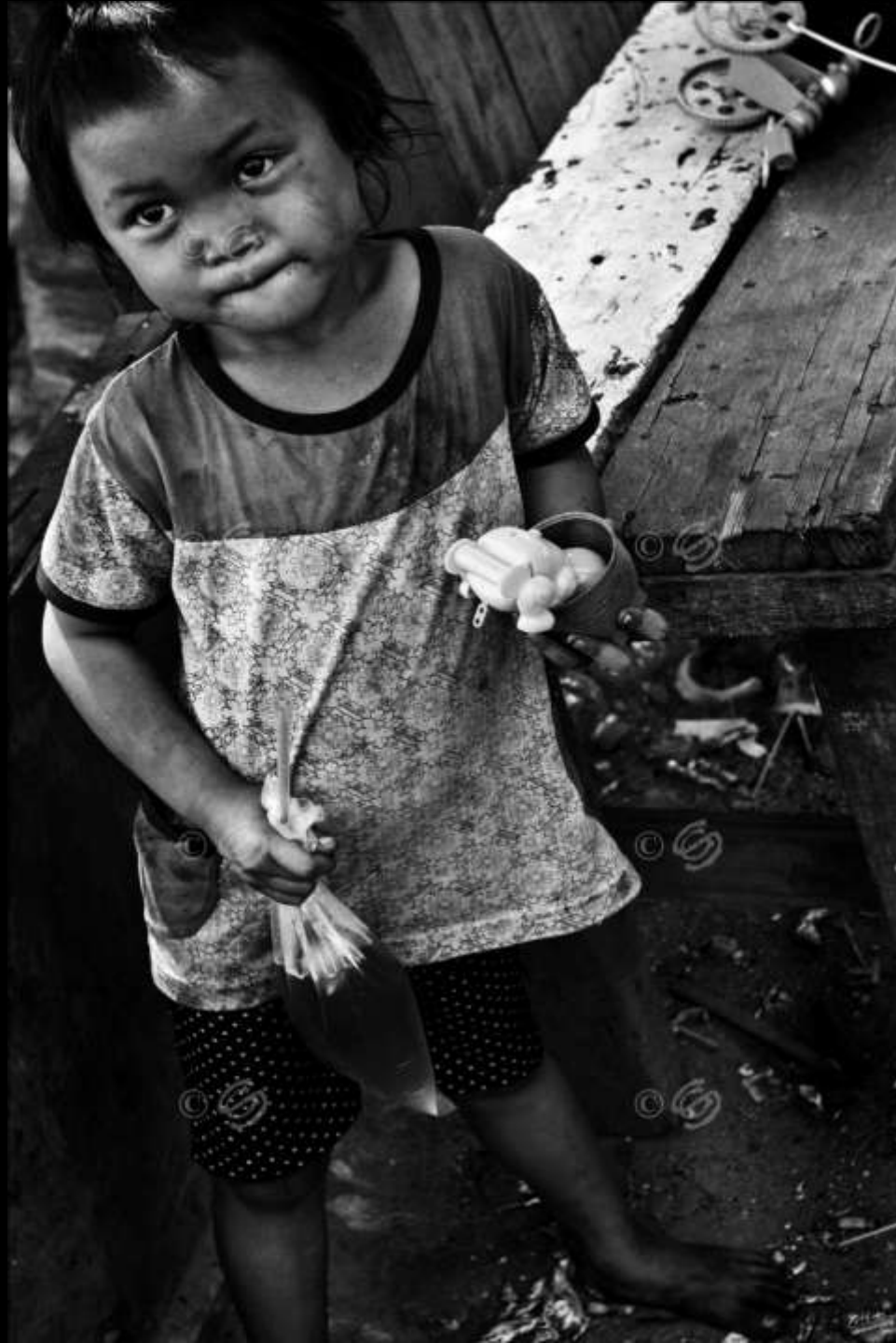
Kramat Pulo. A young girl on the threshold home along the railway in the capital Indonesia.