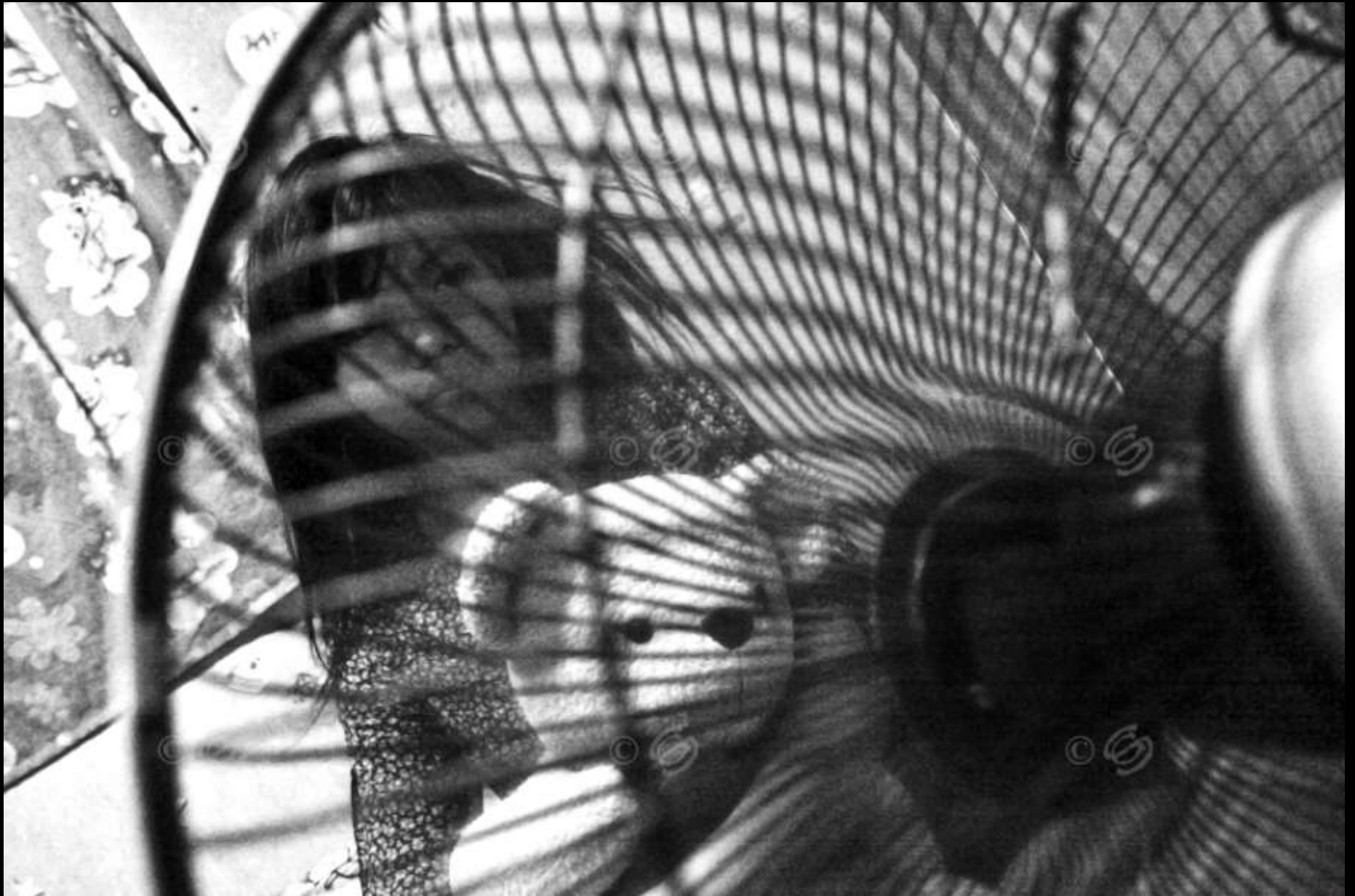
Blue is a girl who lives in the slum of Klong Toey. This area has originated about 50 years ago when the population living in rural areas moved to cities in search of employment and social opportunities.