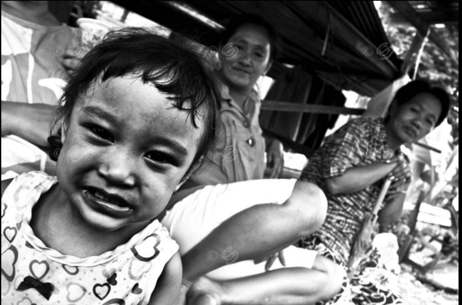
The lack of alternative forces these people to live in those spaces left "empty" from affluent society. The areas where it is not possible to build are occupied by millions of decrepit buildings and a huge mass of people who have only this way of life.