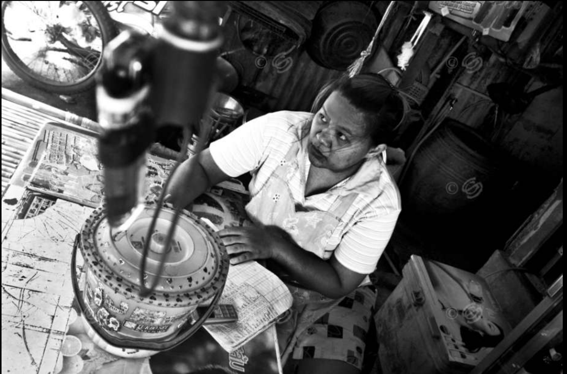
The slum of Bobe is almost in the center of Bangkok, along the main railway line that leading to the main train station. Not far away there is the famous Siam Square: area of shopping centers, restaurants, banks and offices. On the table in your restaurant this woman puts in place the accounts of the day.