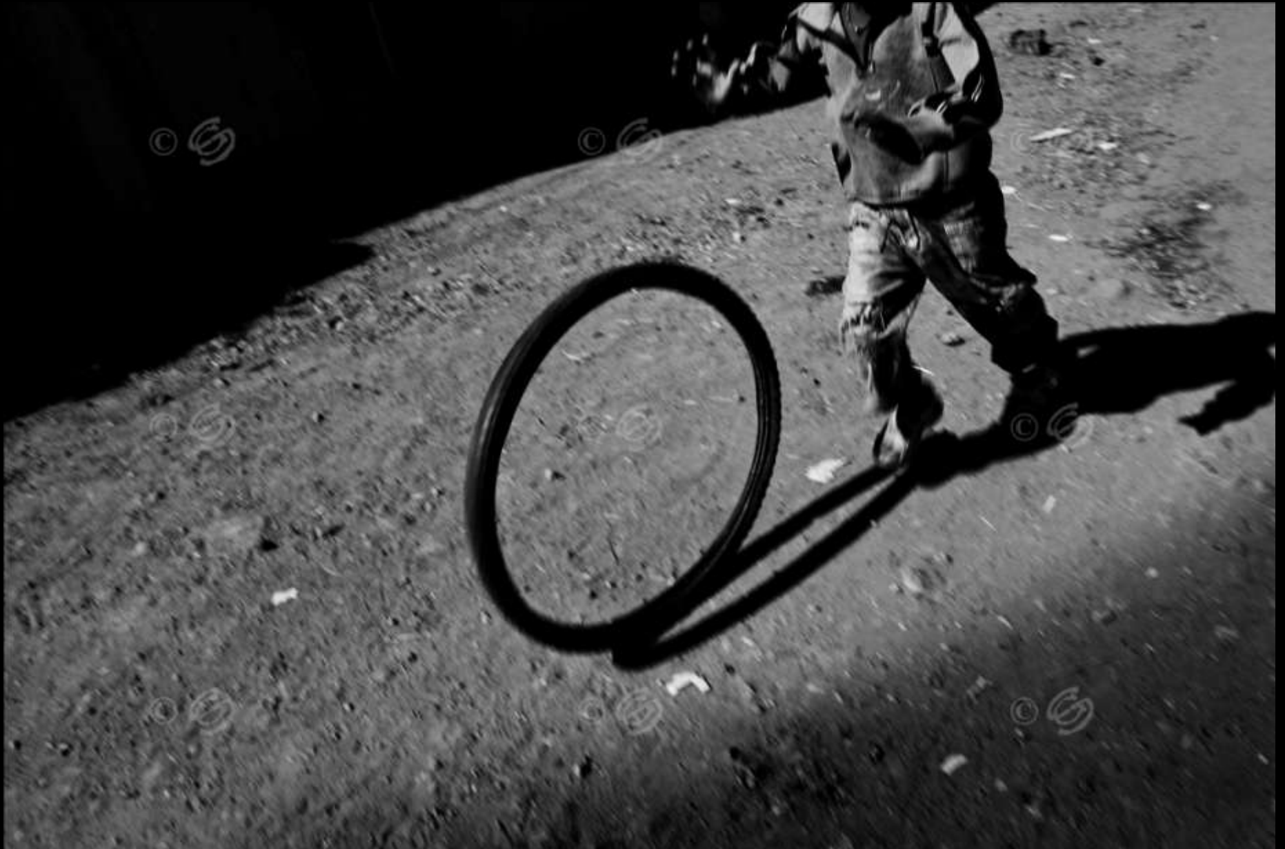
Between the sky and earth of slums unfold in many cases lives and activities that should be only detected and supported. This Ethiopian child pushes his wheel towards a future that hopefully will not be denied.