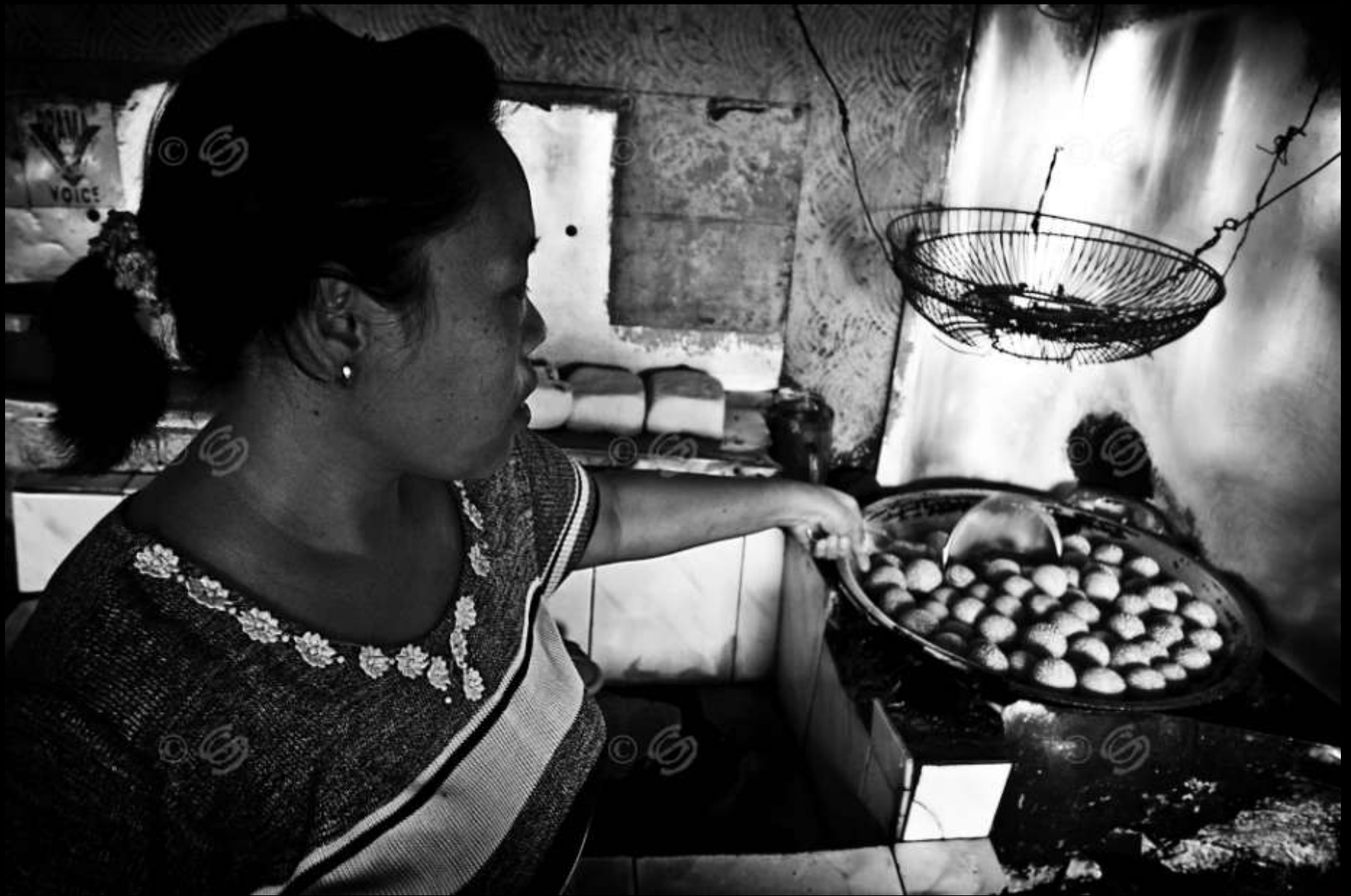
In a small restaurant in the slum of Kramat Pulo, a woman fries meat balls.