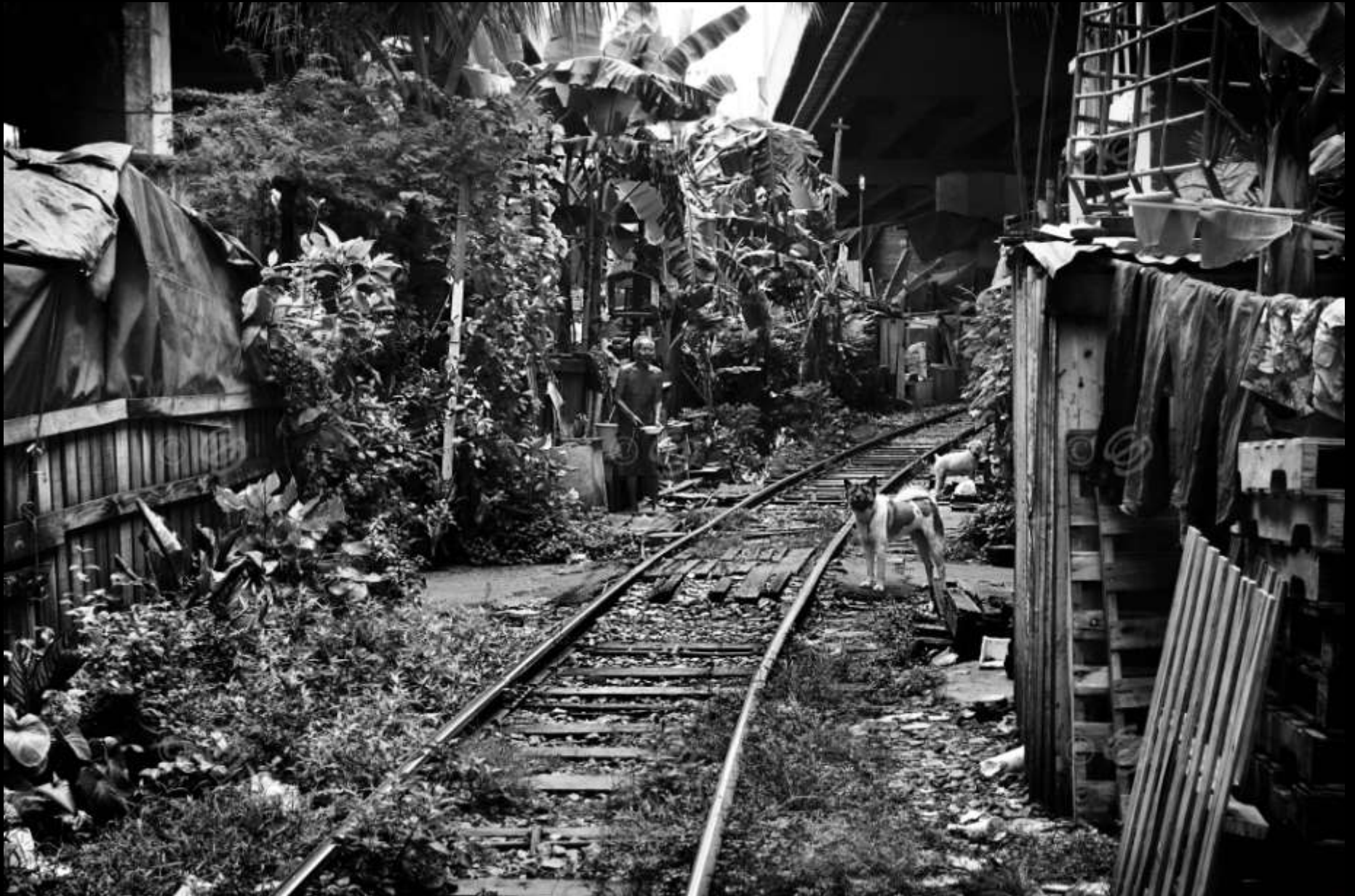
Bangkok. Under the motorway close to the railway stands the slum of Klong Toey. The population density is very high: about 100,000 people live here.