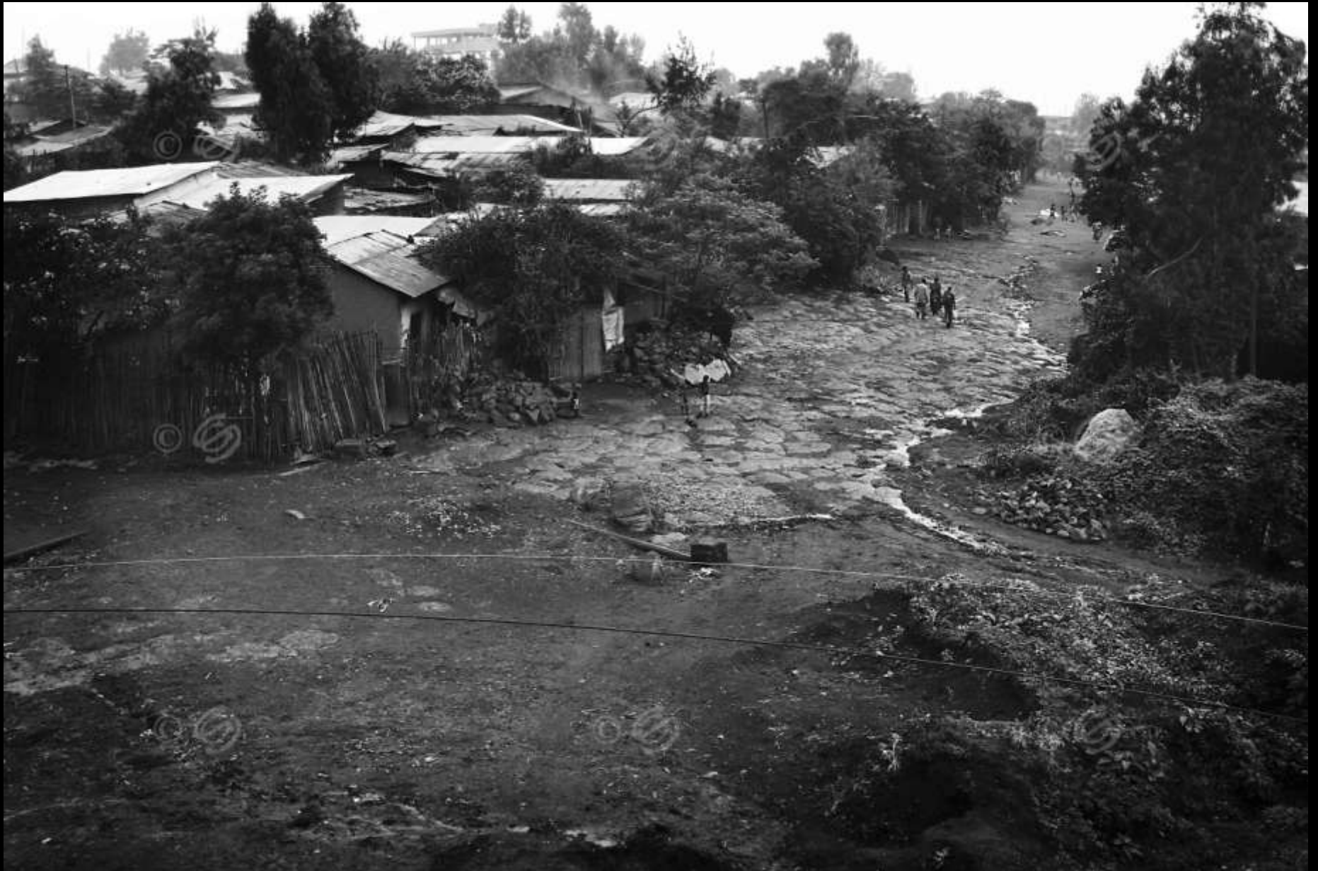
Who are in Addis Ababa, Nairobi, Bangkok or Rio, the squatters who live in the large mass of makeshift shelters, shacks, tents are in the same conditions of life. Here, the slum of Shashamane in central Ethiopia.