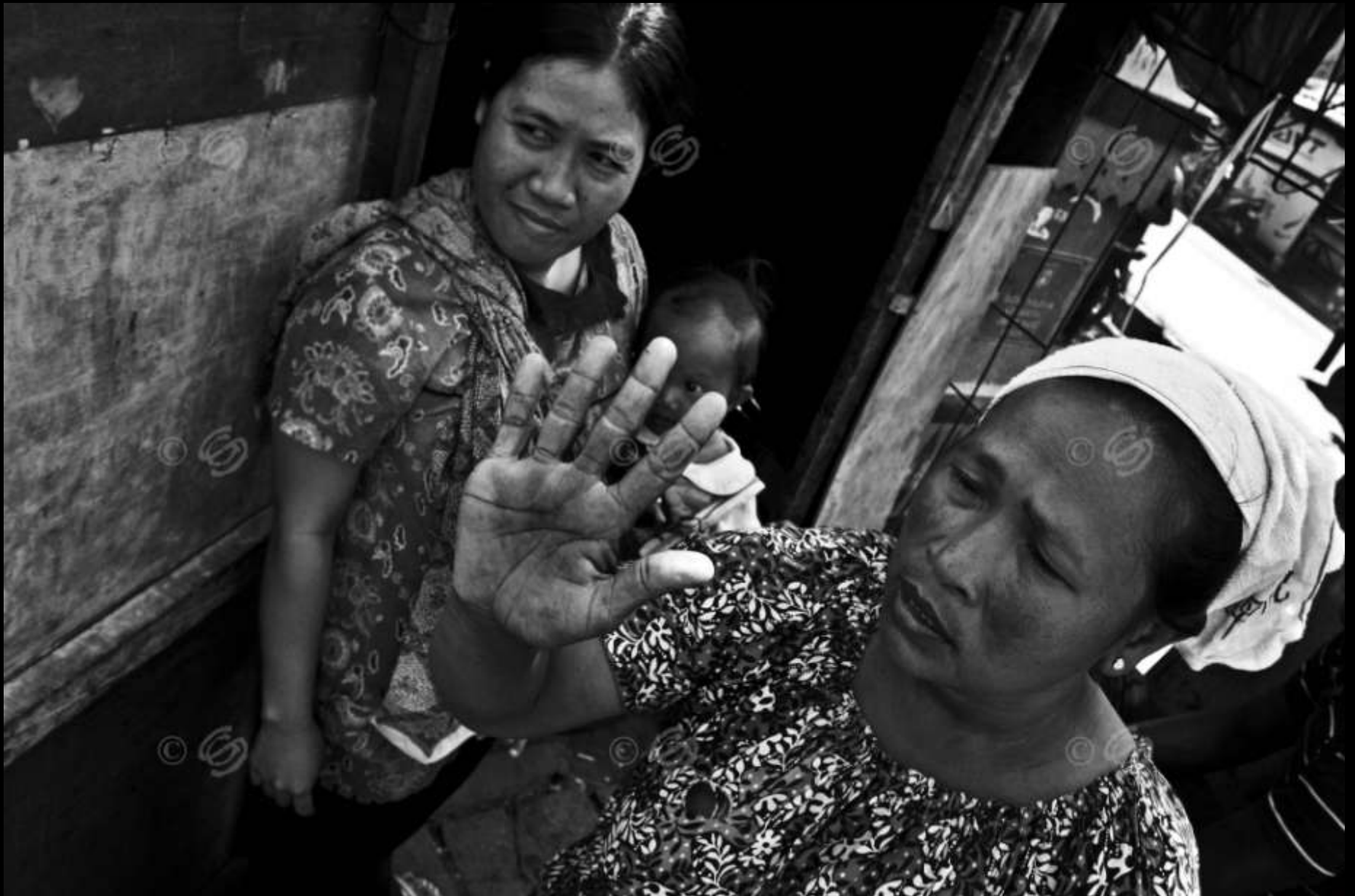
In this wooden and cardboard shack in the slum of and Kramat Pulo in Jakarta, three generations are living here: the situation is claustrophobic, the unhealthy environment and hygiene conditions are very poor.