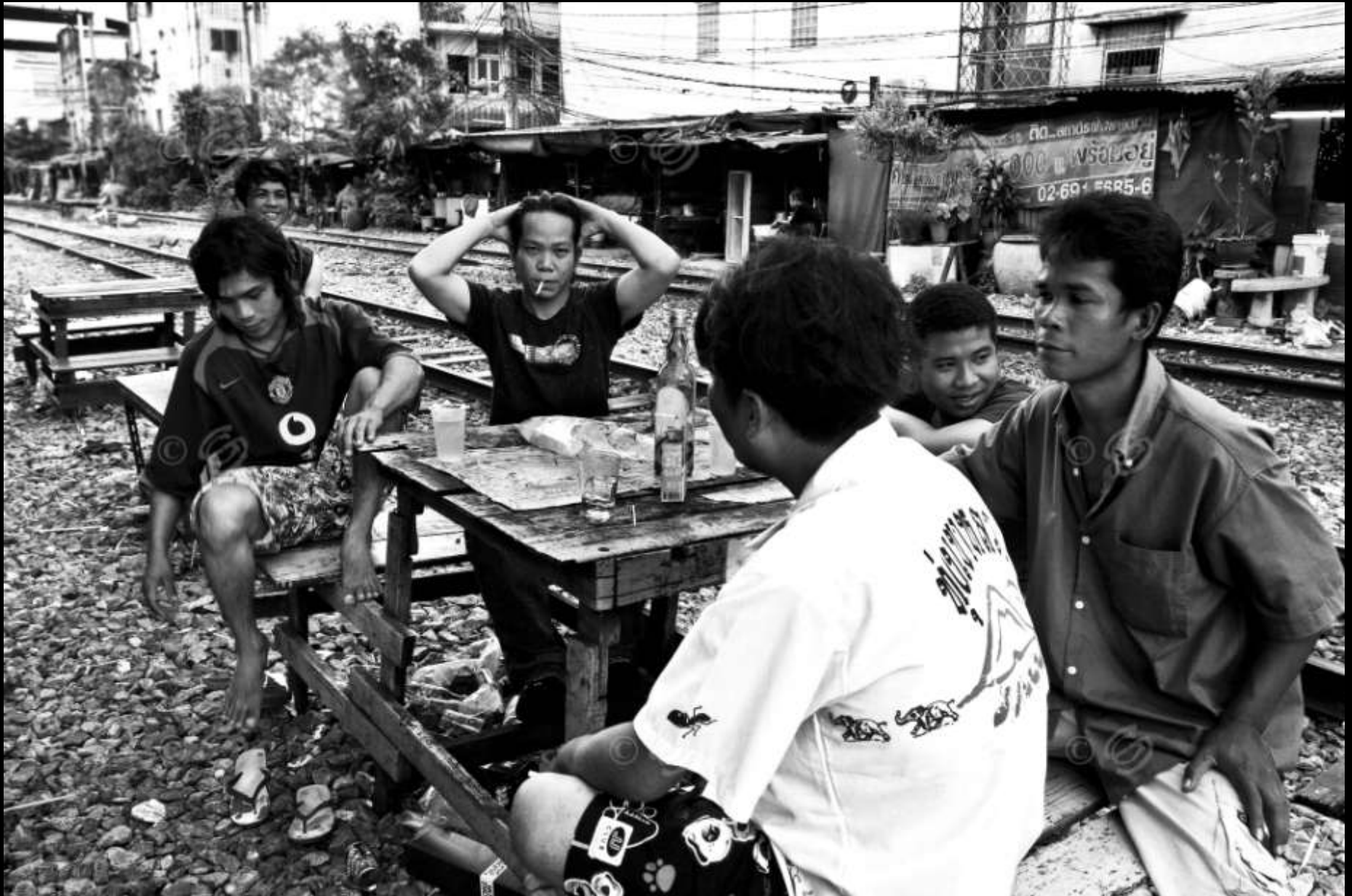
A group of young men in a "bar" in the slum of Bobe in Bangkok. One obvious consequence of this situation of life is the high degree of social distress: drugs, alcoholism, prostitution are often the only solutions adopted by these people trying to survive the daily life.