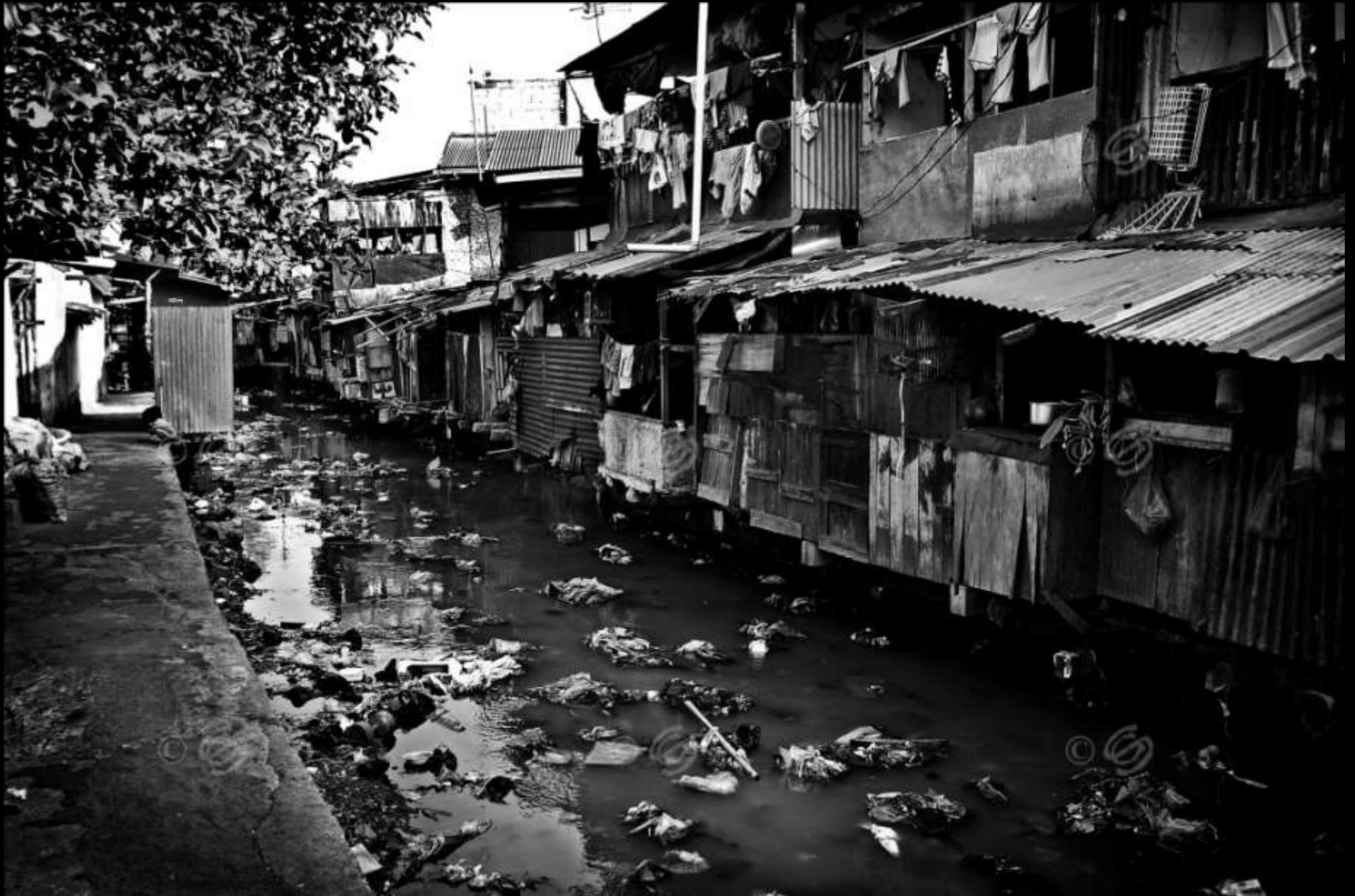
Along the gutters full of garbage in the slum of Ciliwung in Jakarta, a whole neighborhood of dilapidated buildings made by metal sheet is built to house tens of thousands citizens from the Indonesian countryside. In this' area the health problem has assumed alarming proportions, but despite the dramatic situation is not a priority agenda of the government.