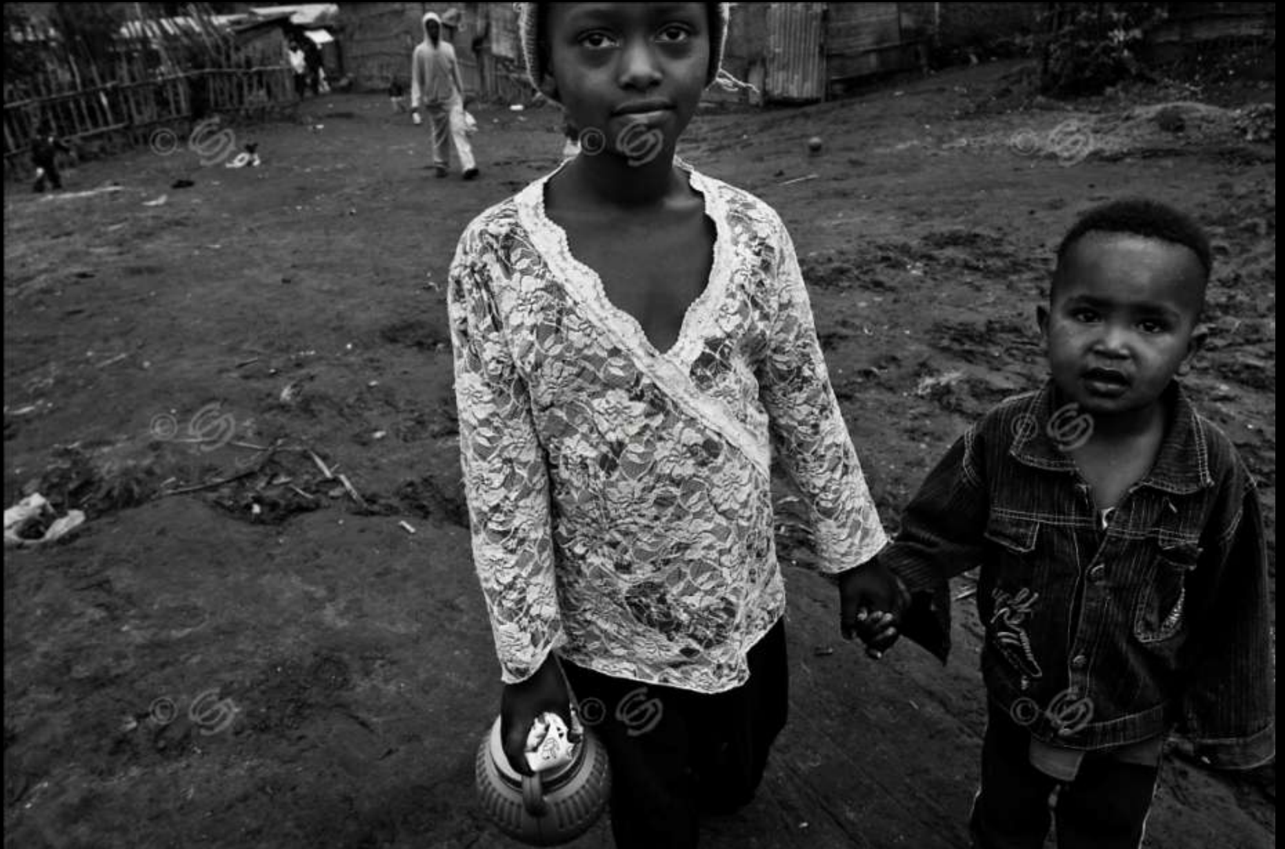
Many NGOs working in this area: the main activities of these groups of volunteers are in range of health: provision of medicines, medical consultation and home qualified care in the case of people with AIDS.