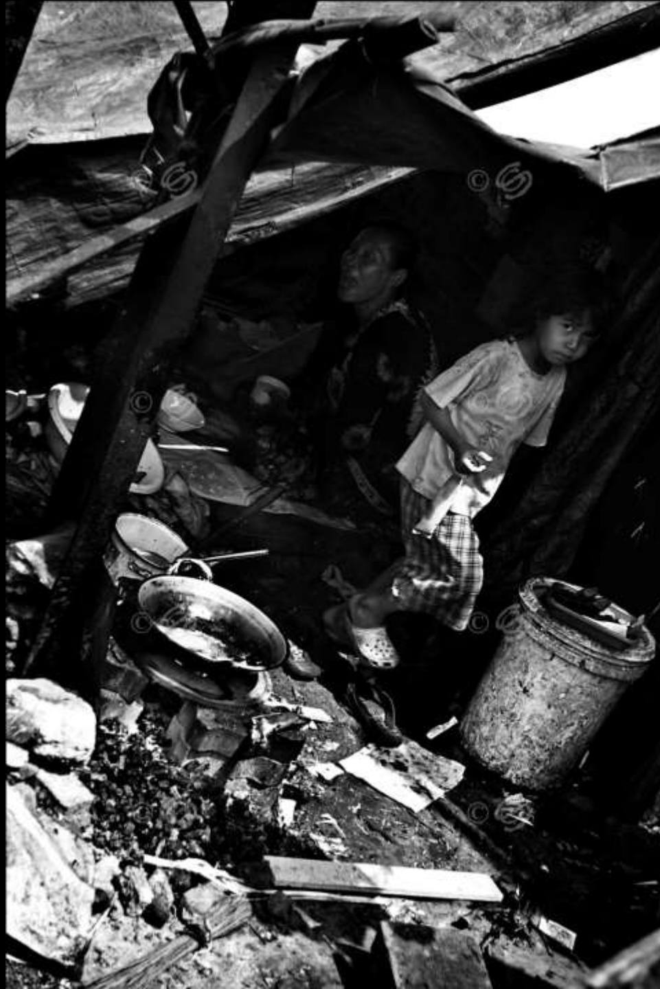
Like lost in a world of dust and darkness, this young girl appears from the darkness of the tent in which she lives. Between soil and waste the pots and dishes for lunch.