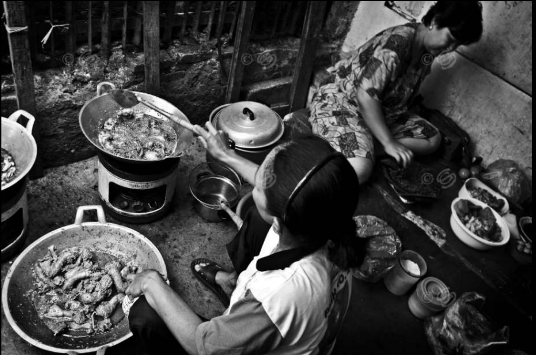
The lack of resources leads to the sharing of many daily activities. Here, two women prepare lunch for their families and other neighbors.