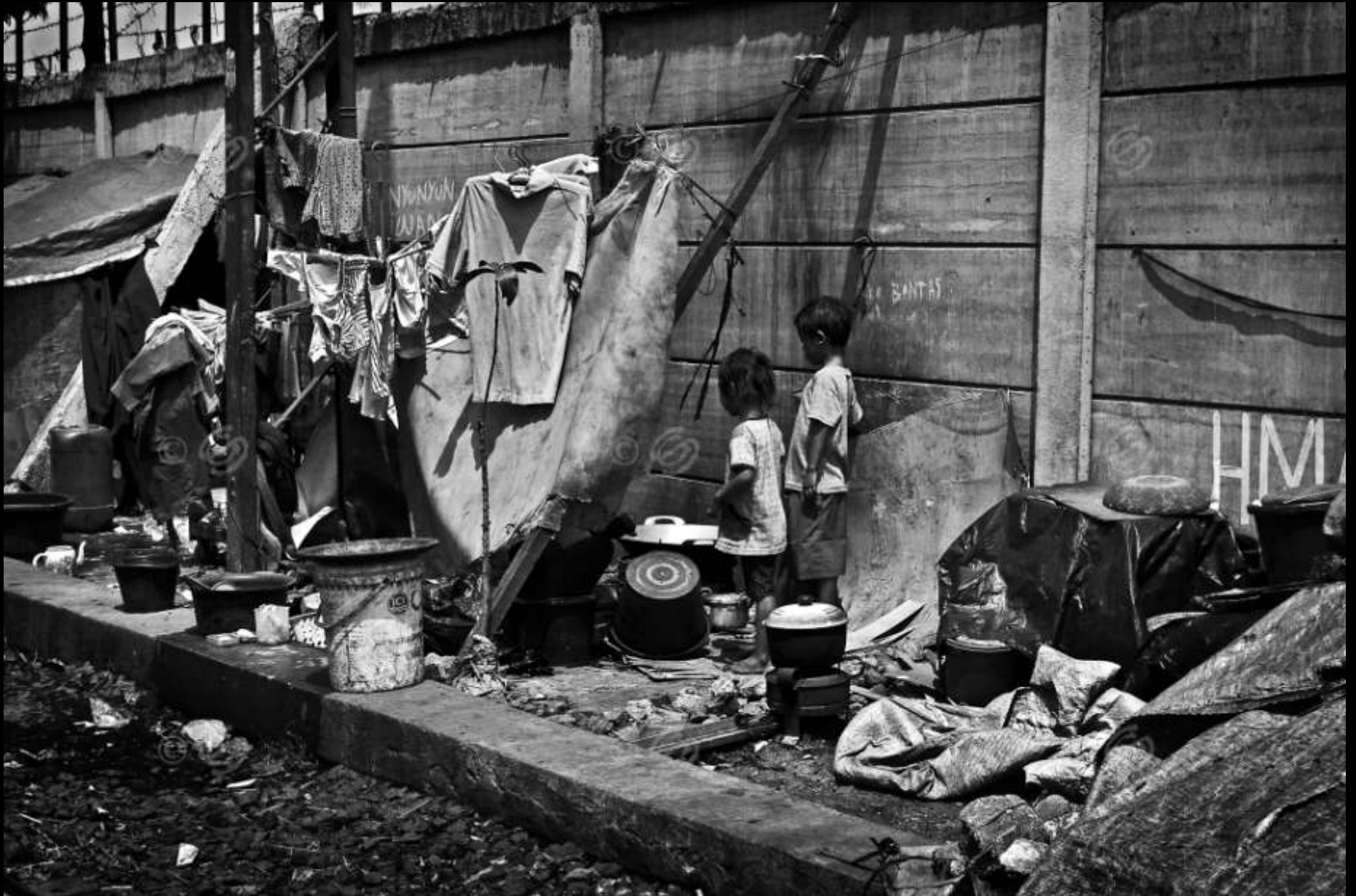
A plastic sheet resting on support posts is the only shelter for these children. The wall of the main line train of the Indonesian capital, is a stage of endless misery and degradation.