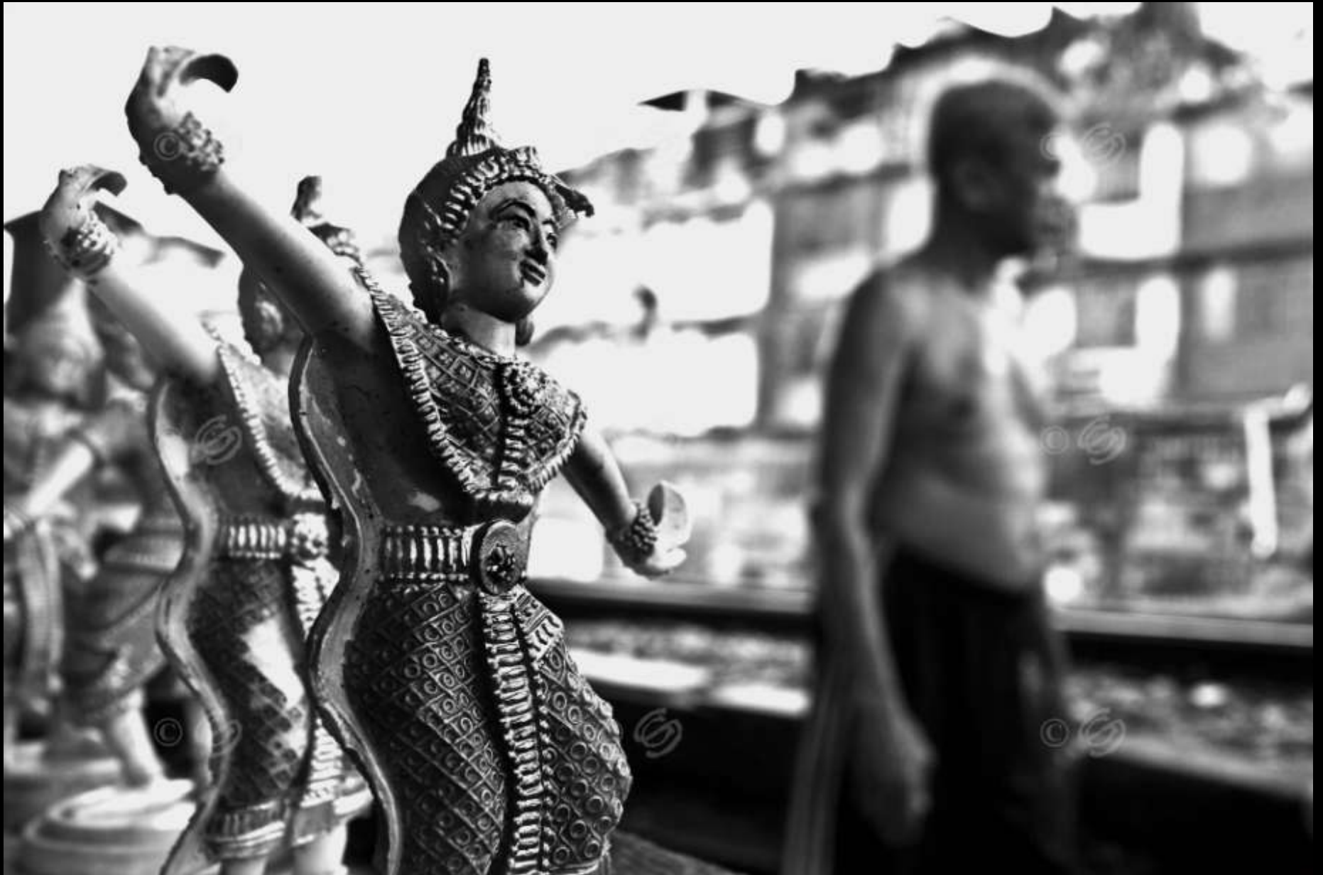
The refined elegance of the statues of Thai dancers invokes a sense of beauty and order almost surreal in this environment.