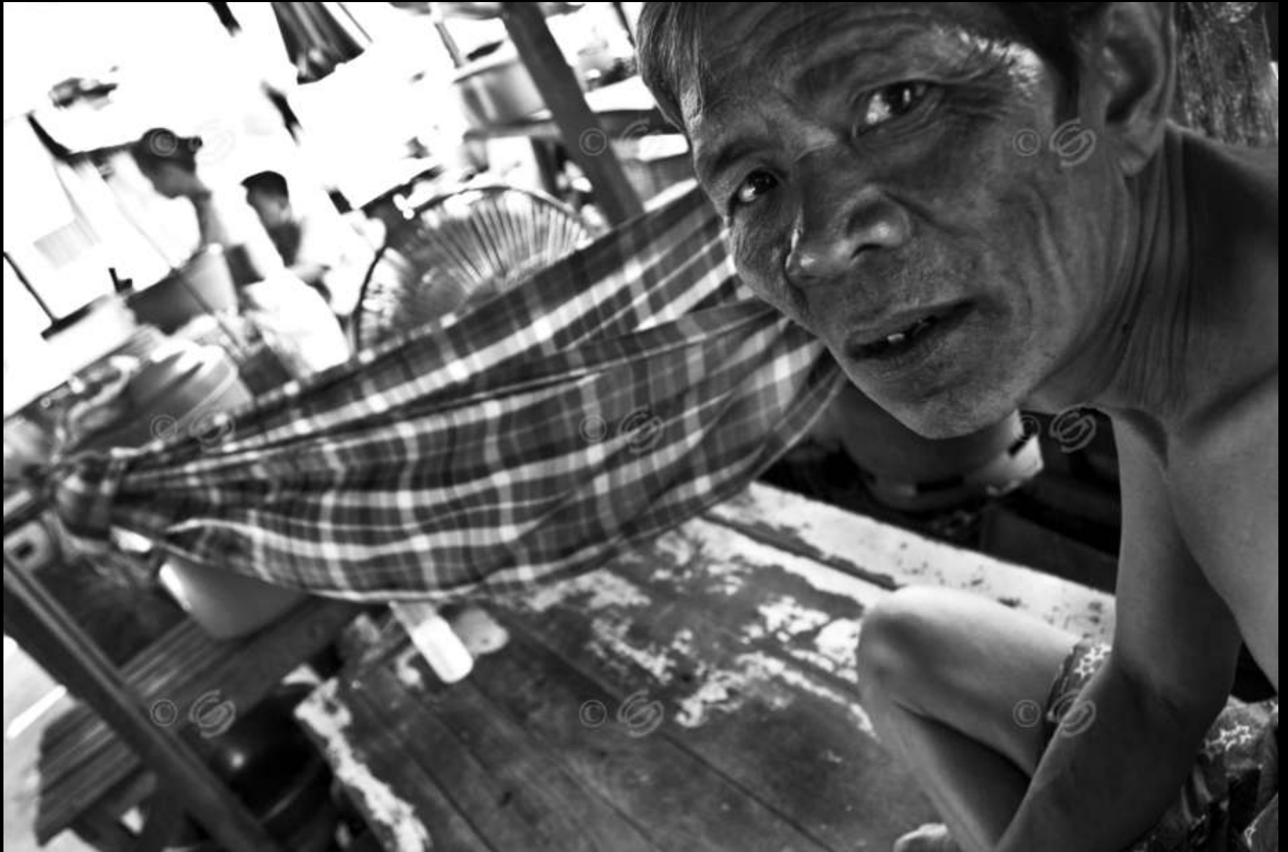
Almost as helpless in the face of reality, this man cradling his nephew in the heat of the Bobe slum.