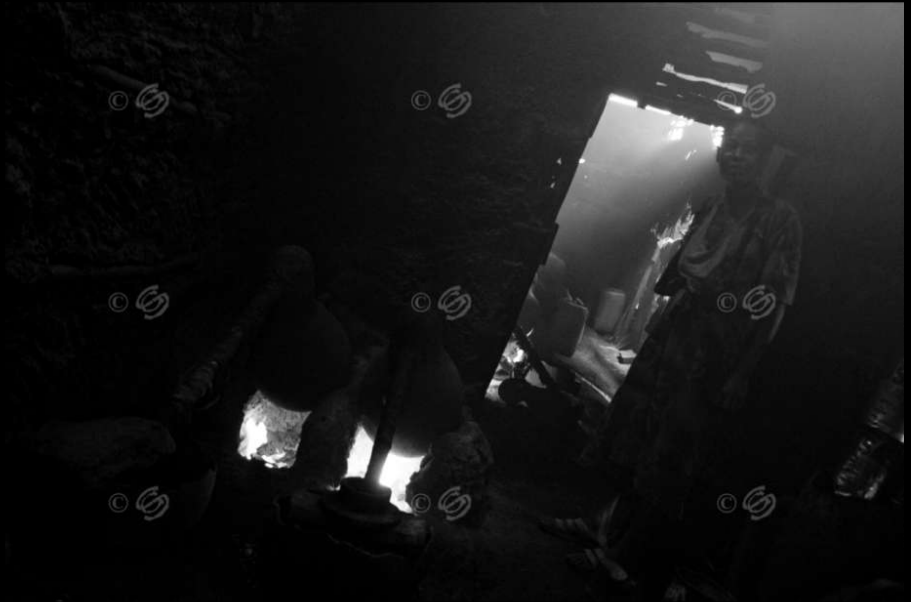
The AIDS is a social evil which has long been devastating social and economic structure of Ethiopia. Here a woman in his house of straw and mud in Shashamane, Ethiopia.