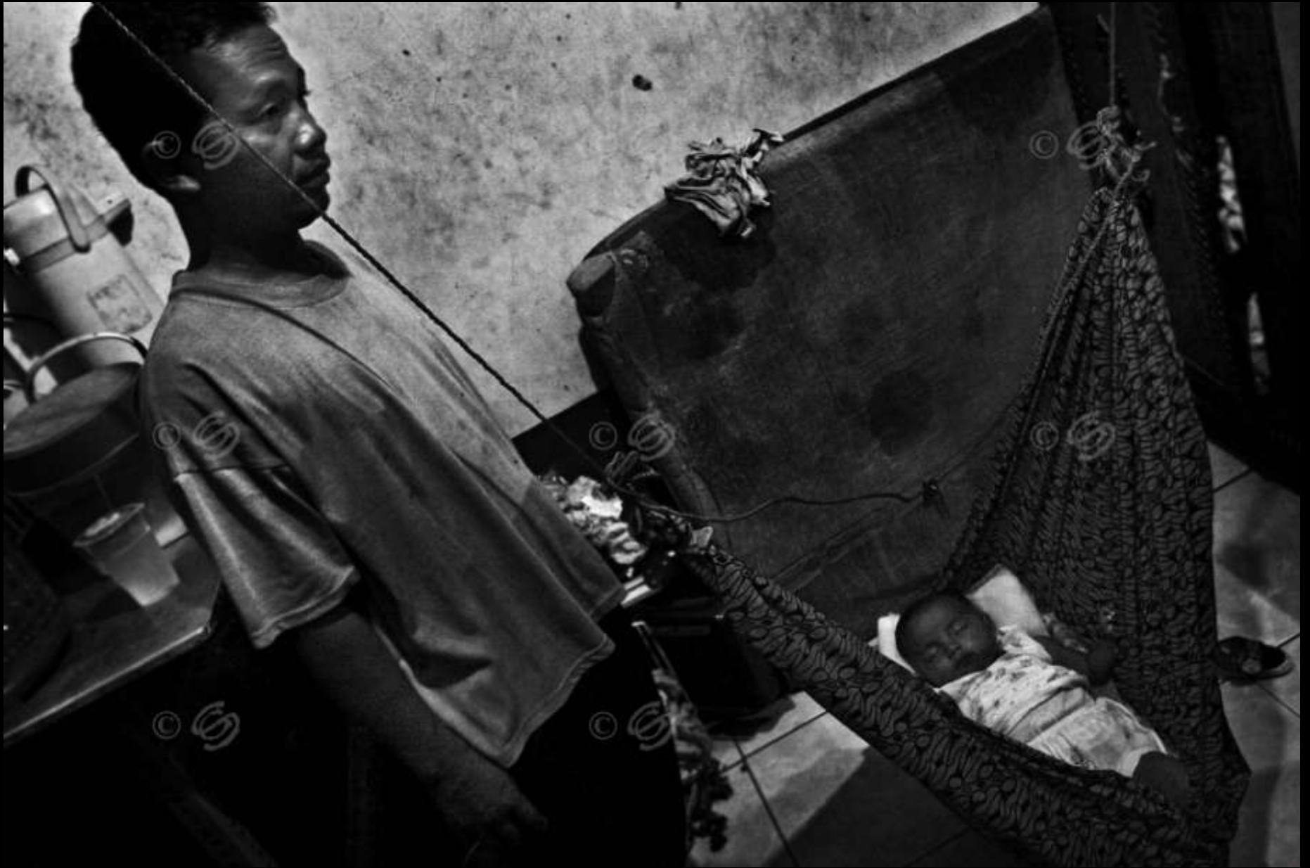
In the one small room of their home, this couple welcomes their baby. The cradle is fixing on the ceiling due to small dimension of the room.