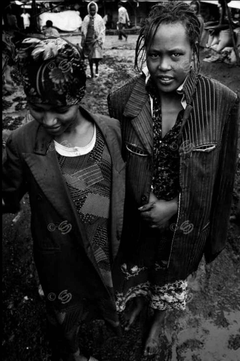
In some cases, slums work predominantly as supply of labor for the “high” city. Here two girls in the slum of Shashamane - Ethiopia