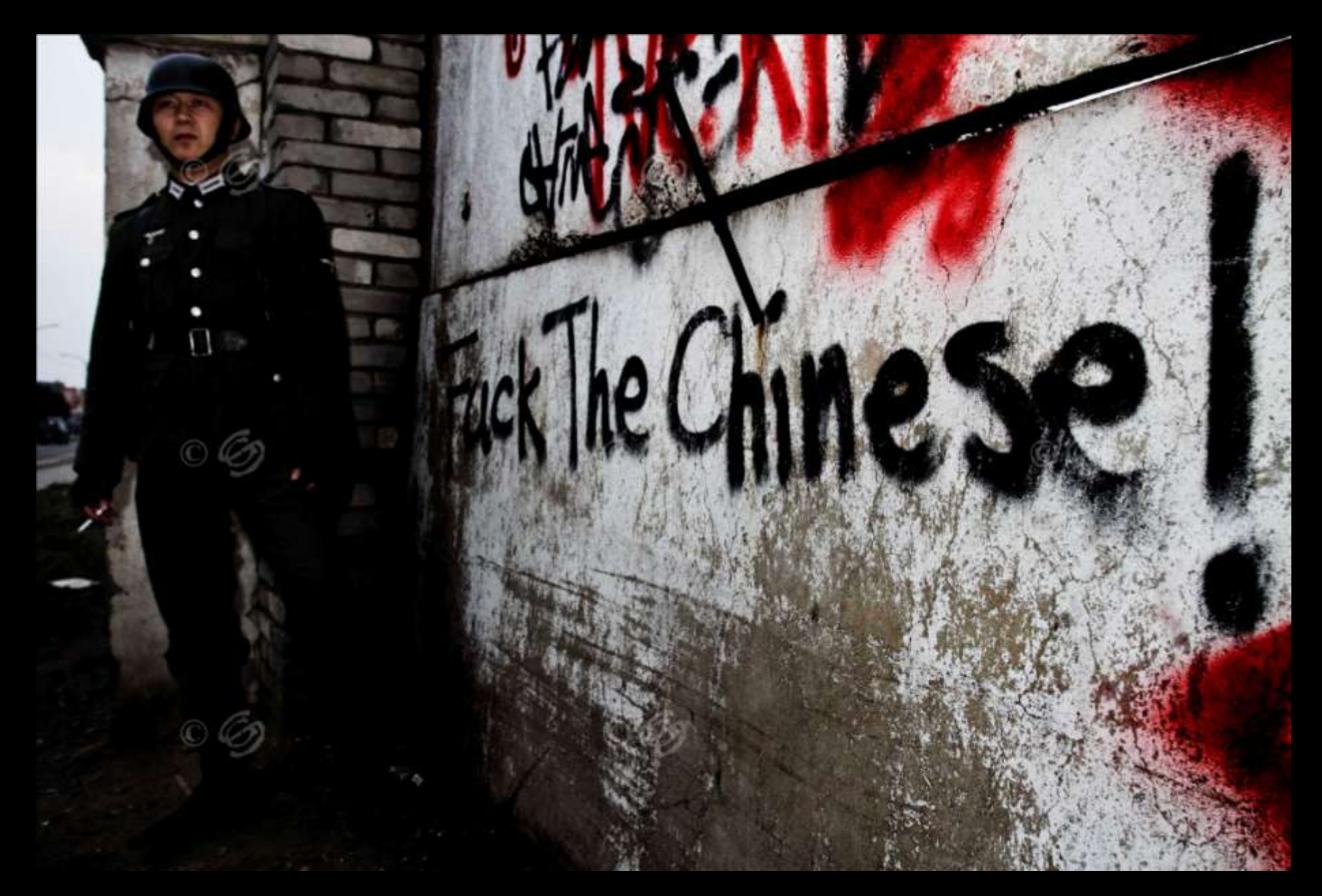
Mongol Nazi war is based on hatred.