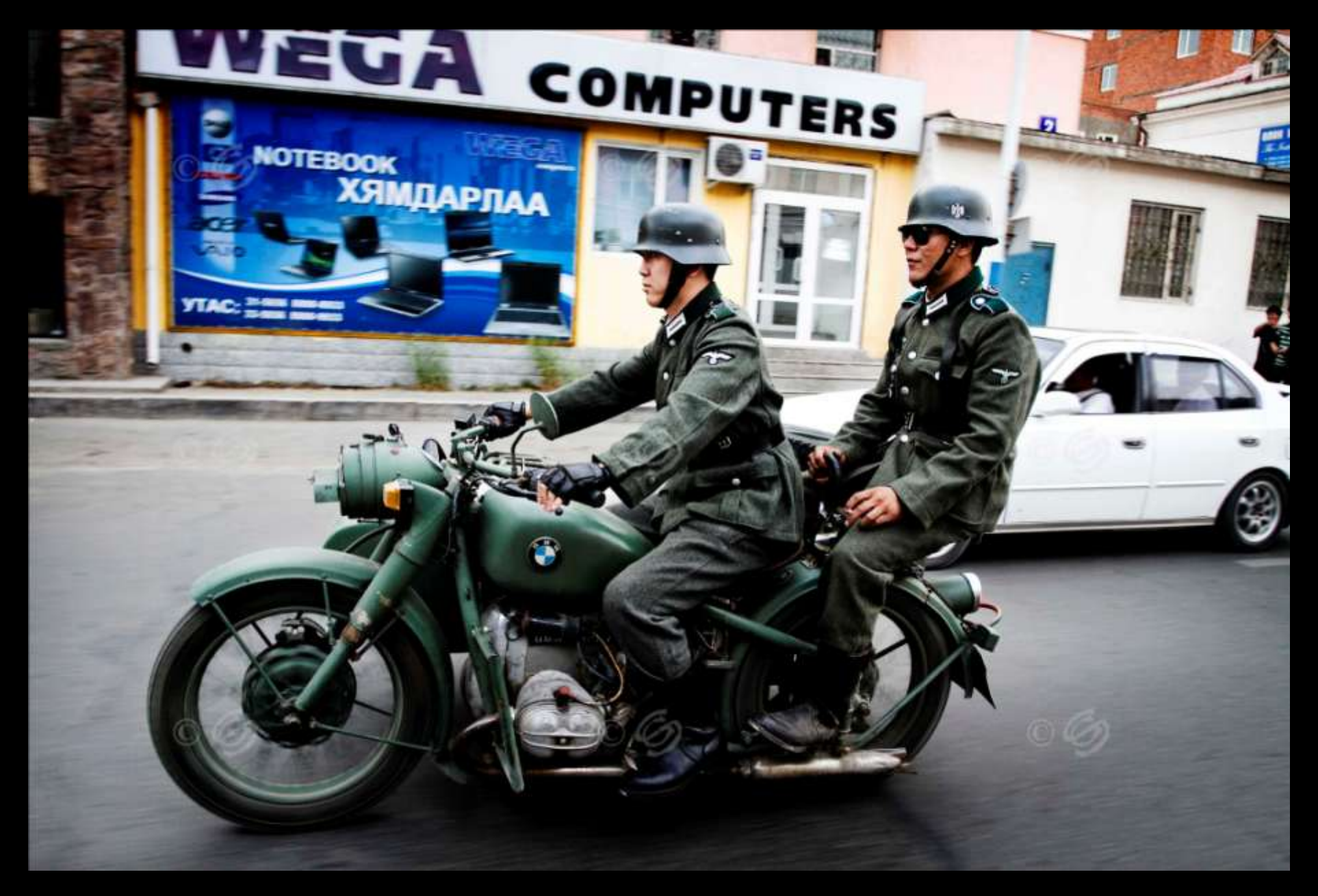
Advertisement from global market, buildings in soviet style, Nazi uniforms: a contrast that Ulaan Baatar find it difficult to assimilate.