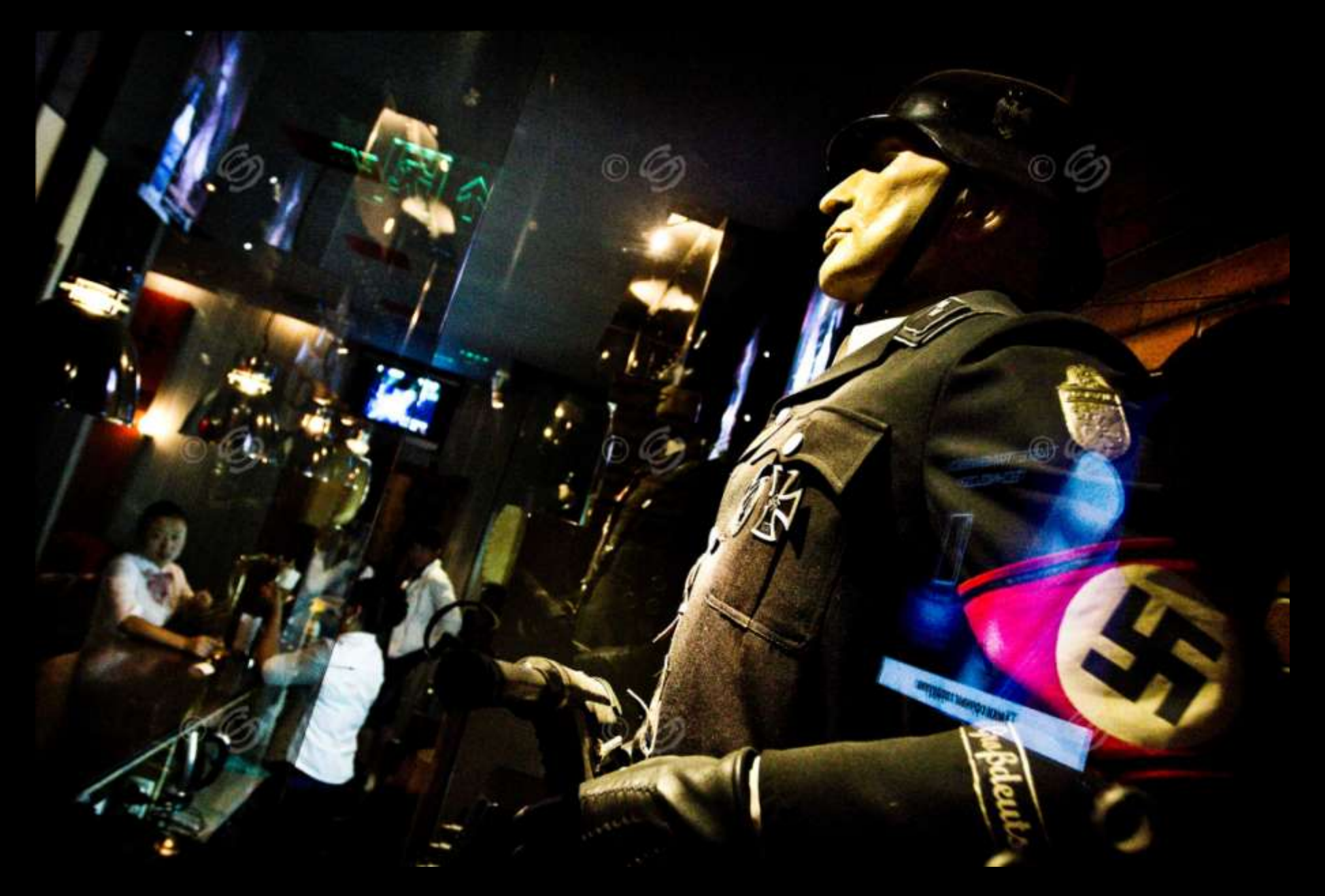
The Tse Bar is a window where Nazi myth is celebrated.