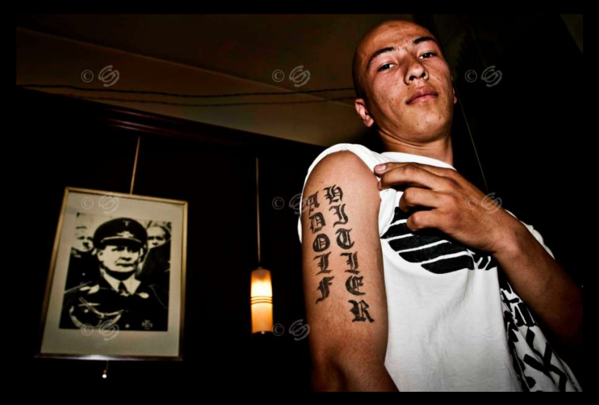
Nazi symbol tatooed on the skin means follow a faith, belong to a Nazi group. Tatoos seems a destiny for those guys.