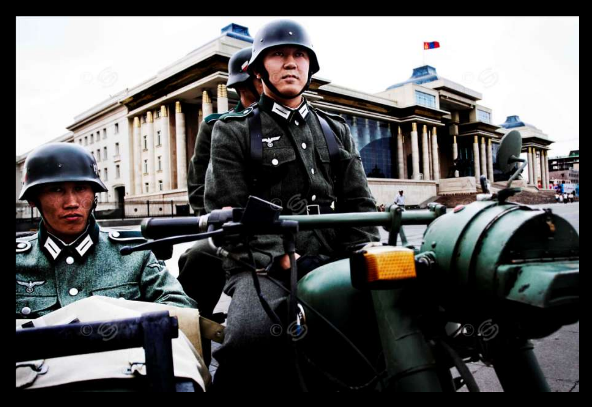
Sukhbaatar square: Nazi group in the core of Ulaan Bataar.