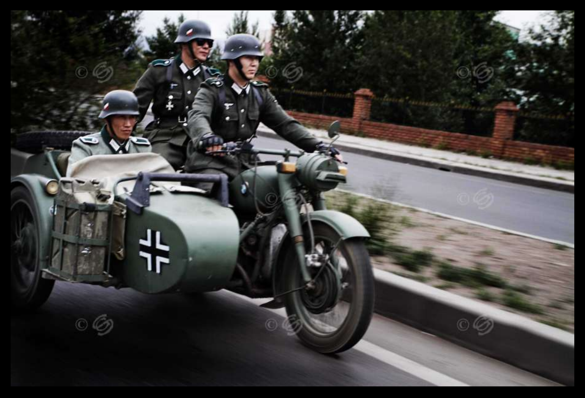
Rush toward a future that could give Mongolia back to Mongolian people: this is one of the target of this Nazi group.