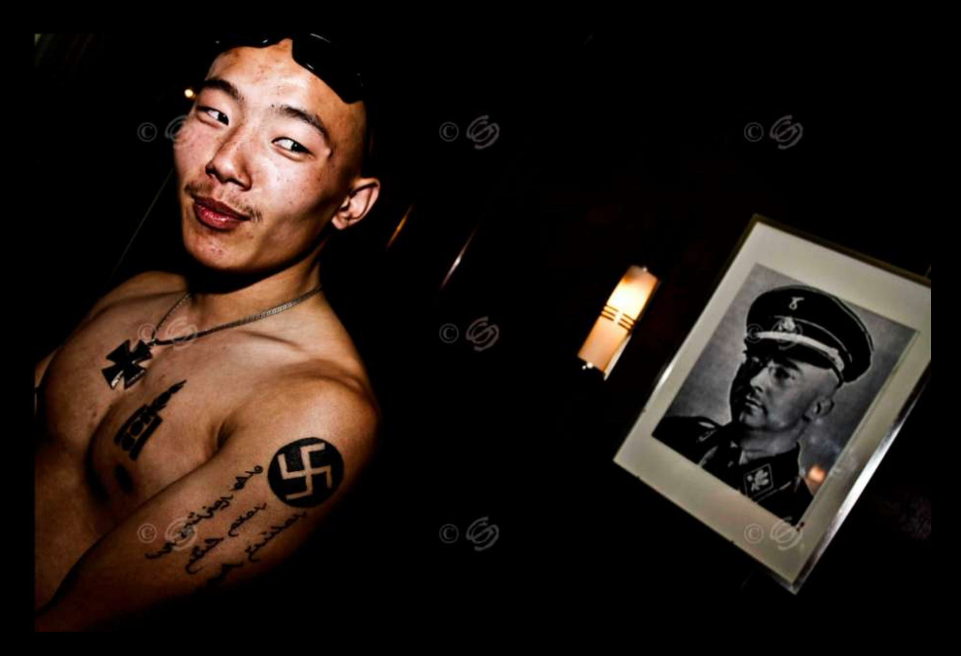
The glimpse of this skinhead seems looking for freezing Himmler eyes on his back.