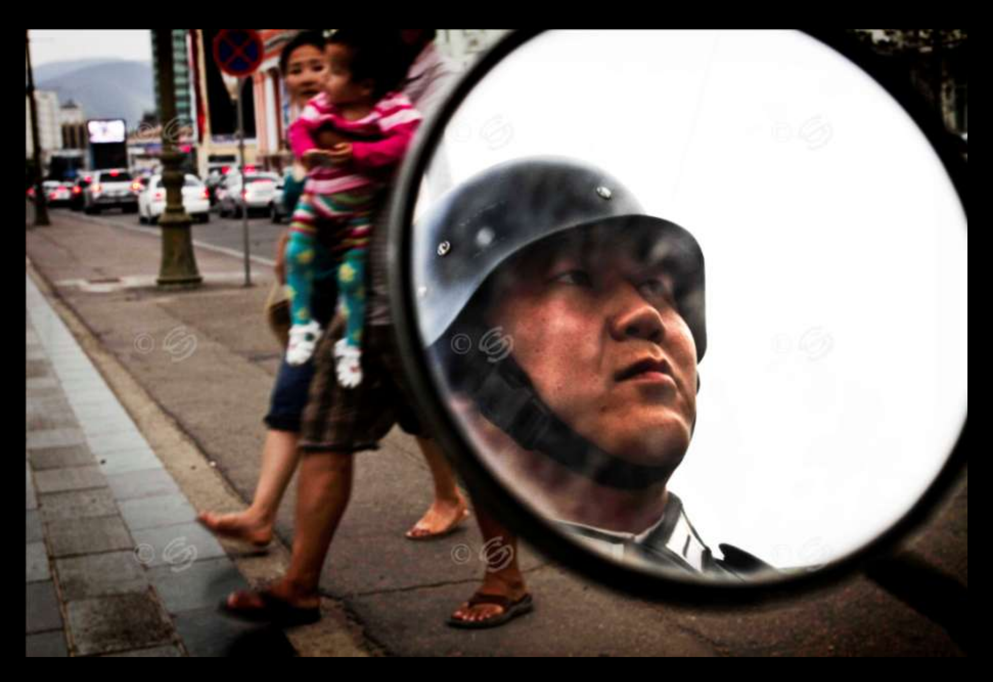
After many years of russian domination, people looks astonished Nazi uniforms.