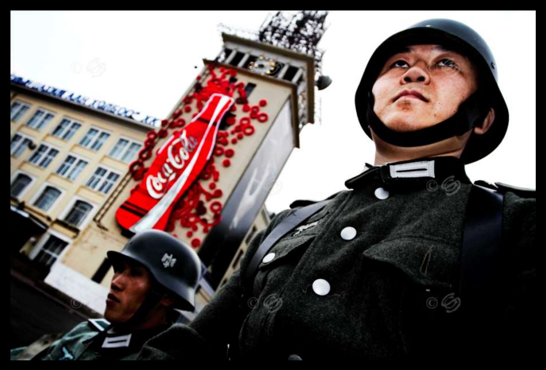
The brand of global market on soviet building: this Nazi groups are working to build an authentic mongolian socety, without foreign contaminations.