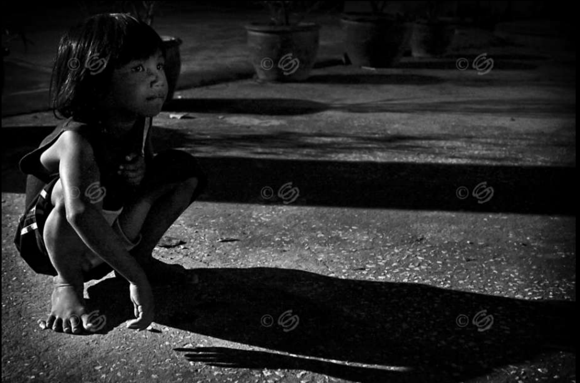
Smaller than her own shade extended on the street, this girl is abandoned to herself along the border.