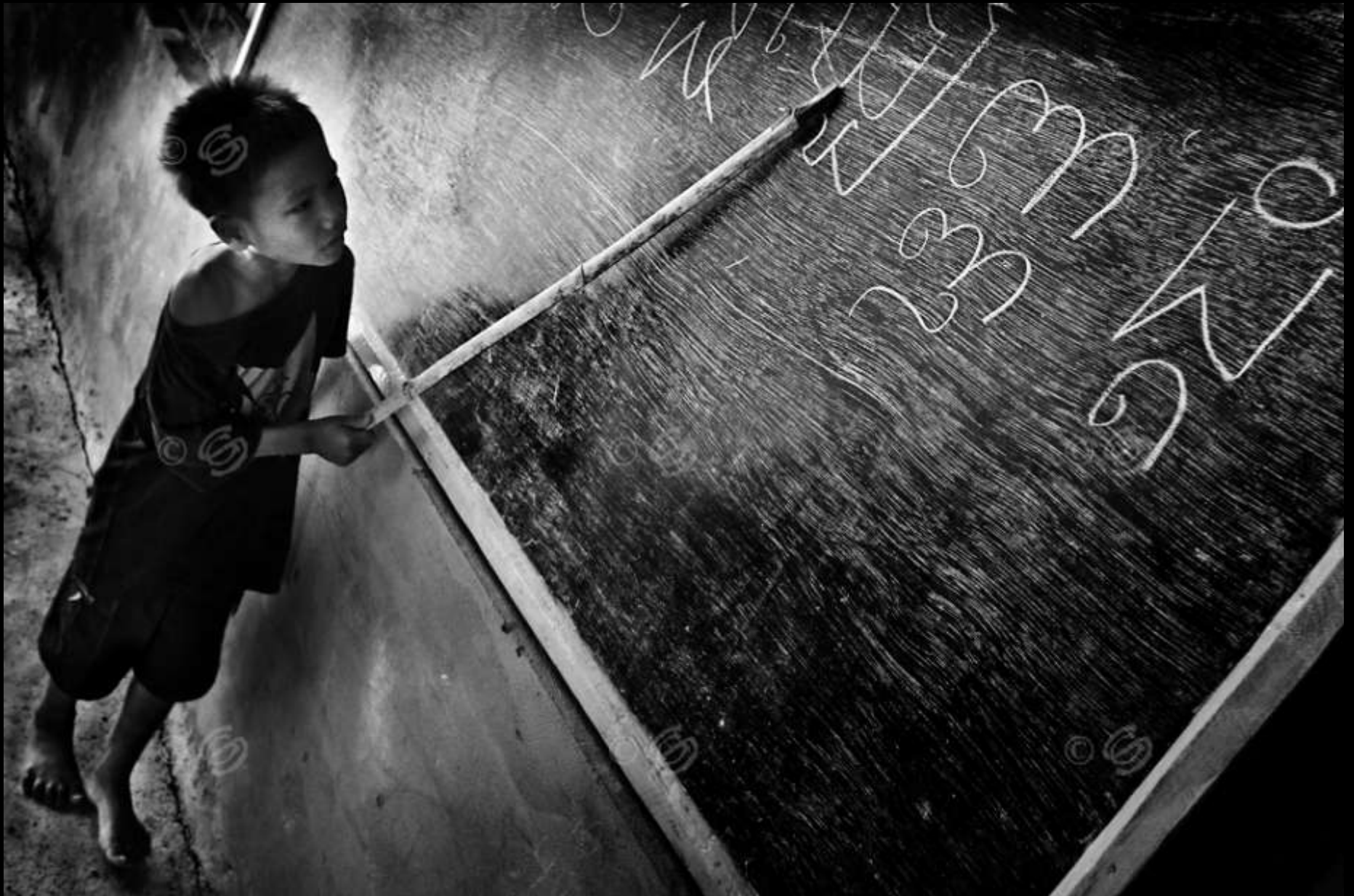
Many children are bought by the criminal organizations from the poorer families with the promise to give a better life to their children. This boy attends a lesson at the Damnok Toek NGO after having been saved from the criminal organizations.