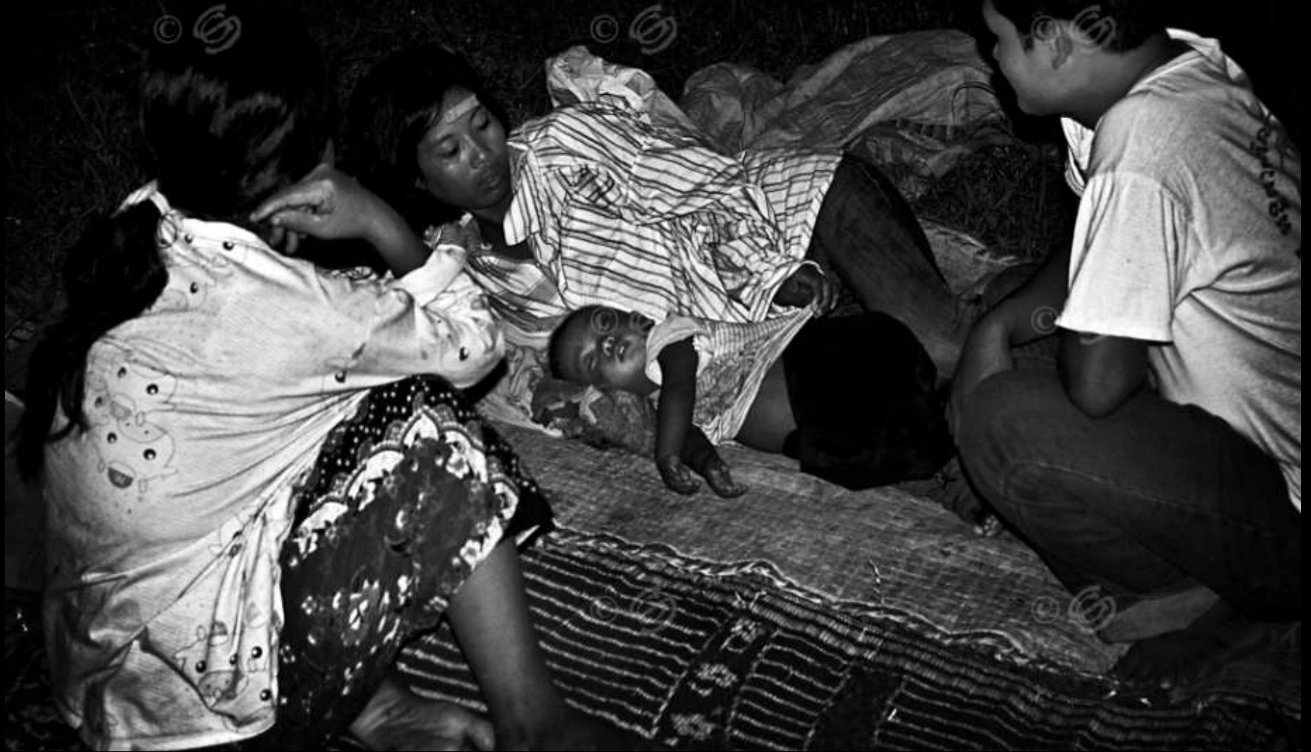
A young mother with her child on a blanket in a casino flower-bed: this is all she can call home. Her drug-addict husband spends all begged money to purchase the glue.