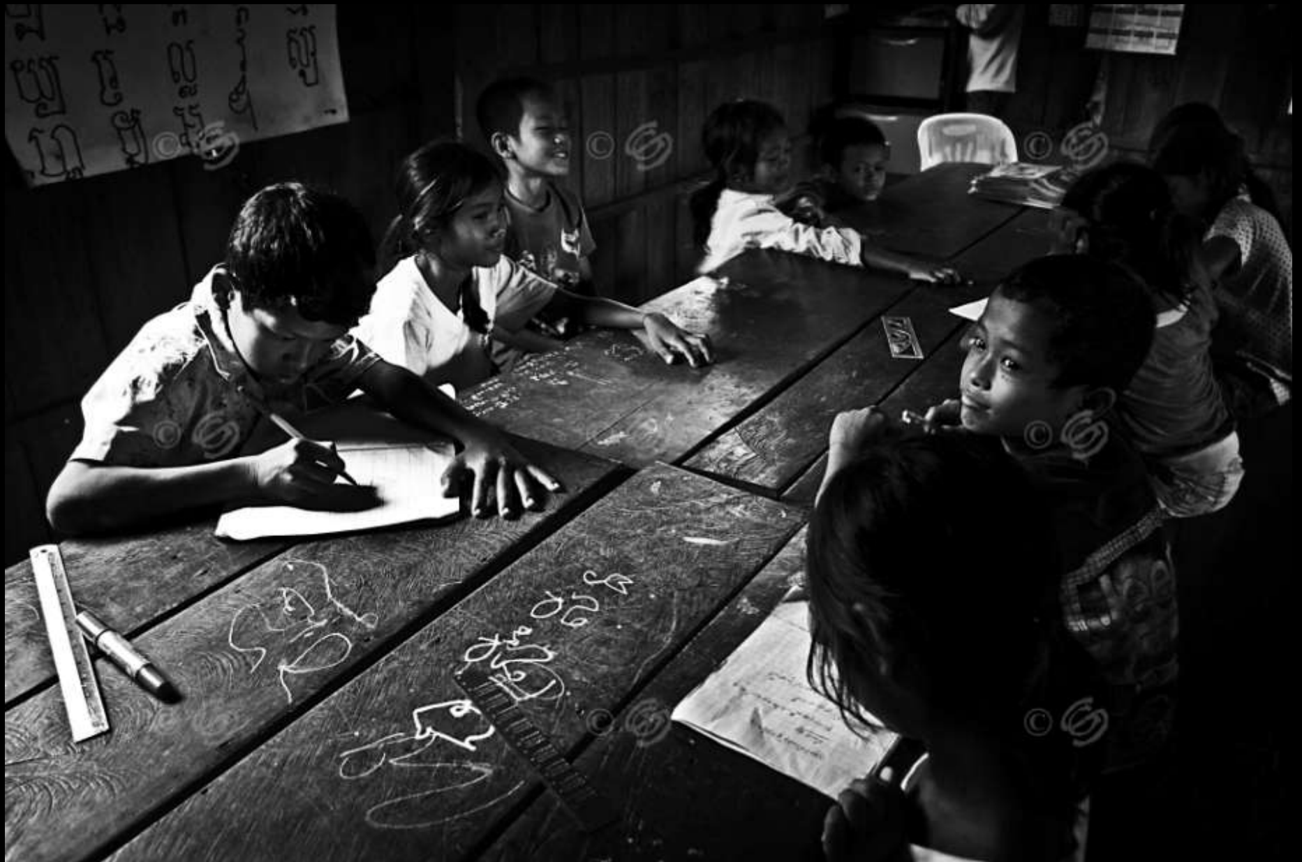
After the lessons, the children do their homework together before the recreation hour.