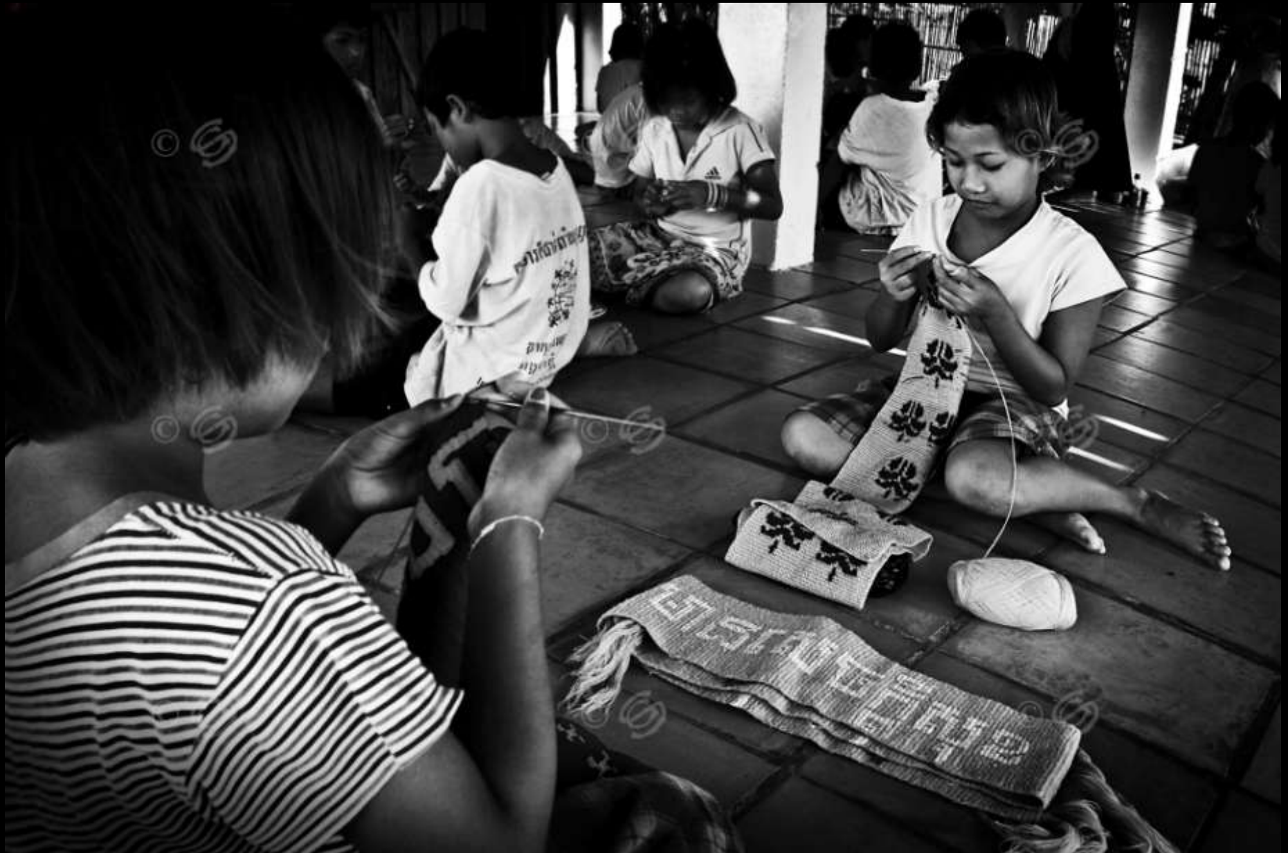
Not yet ready for more demanding lessons, these girls, who have been saved from the criminal prostitution market, are committed in a project that includes small manual works with the purpose to rebuild and develop their relationship and socialization capacities.