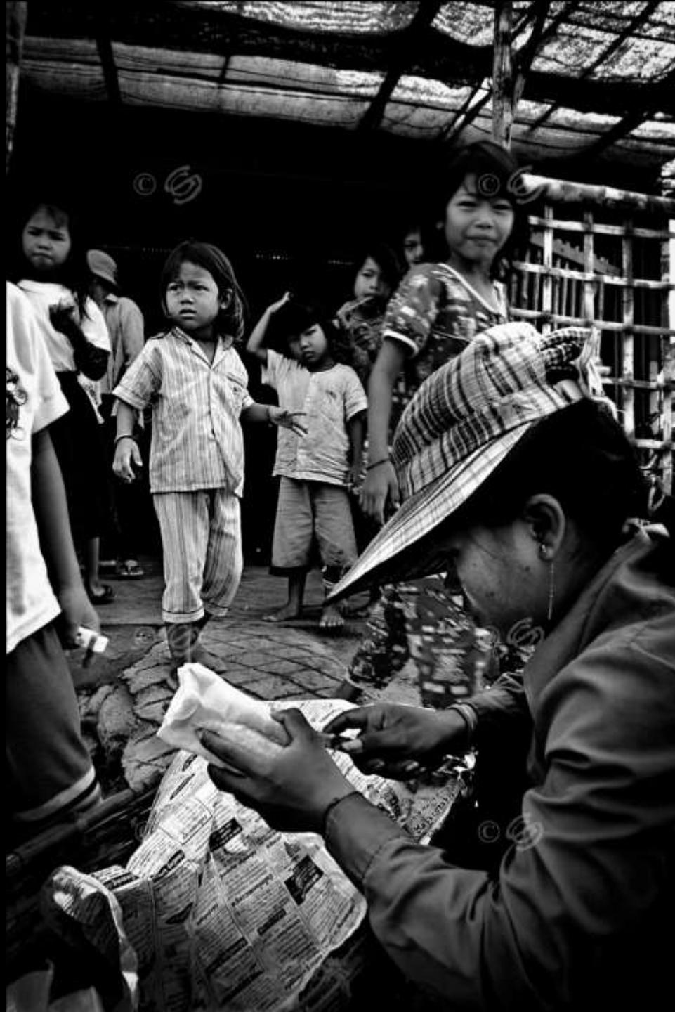
A piece of bread with butter and jam: a small snack that a volunteer prepares for children before they go to school.