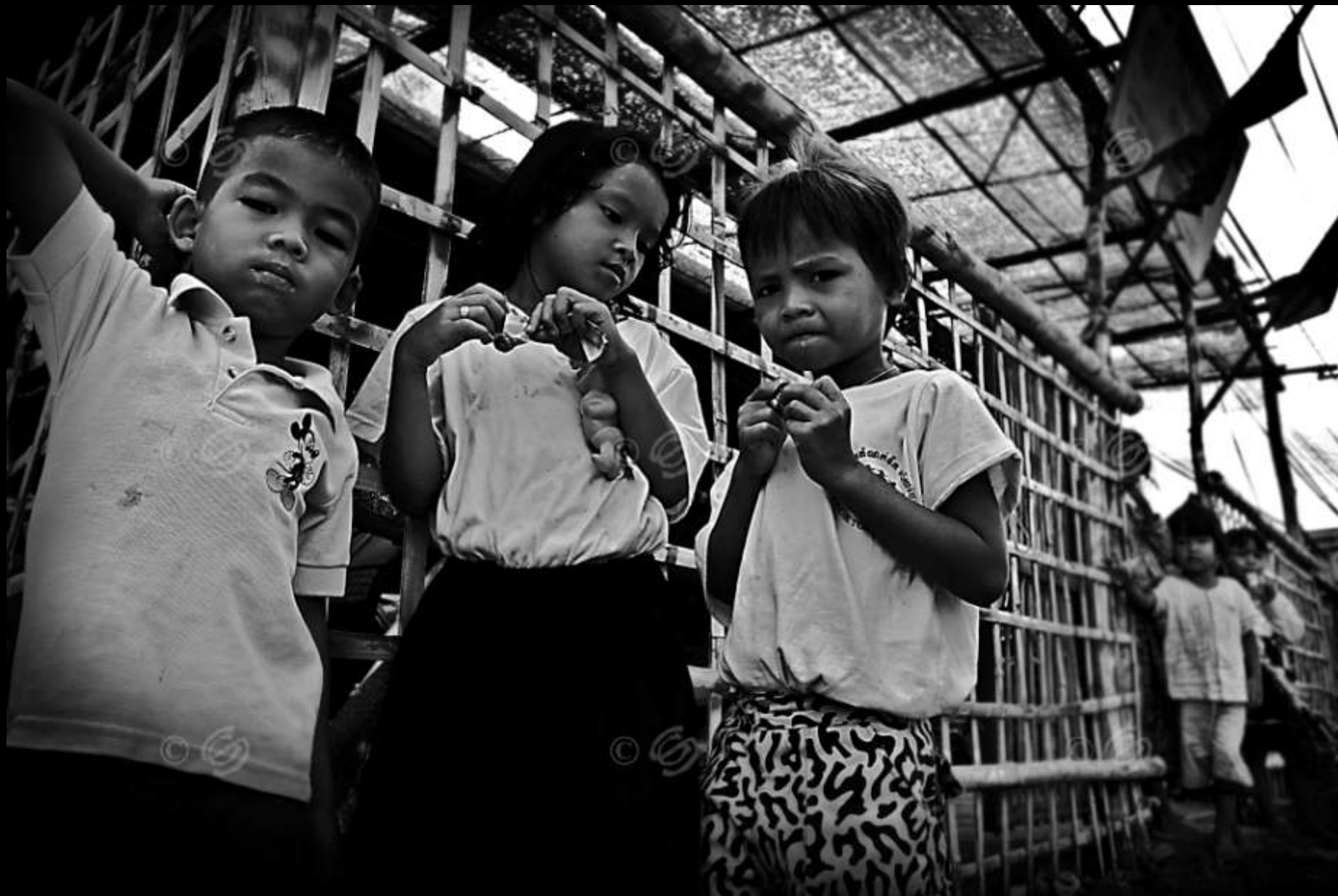
The children welcomed by the Damnok Toek association spend the whole day together. Socialization is one of the fundamental requirements of the recovery projects.