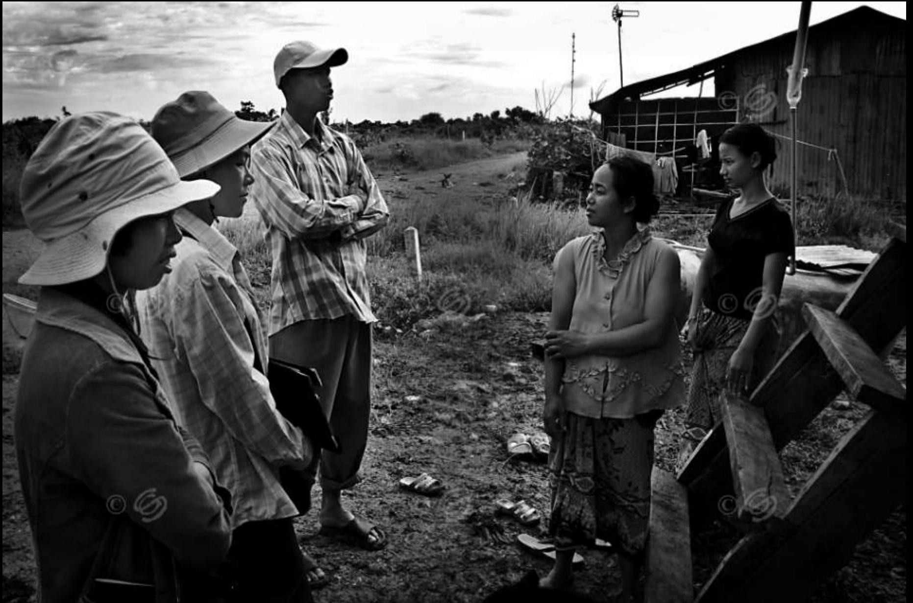
The NGO operators try to convince the families at risk to send their children to school in the attempt to stop the flow of children toward the Thai prostitution circuits.