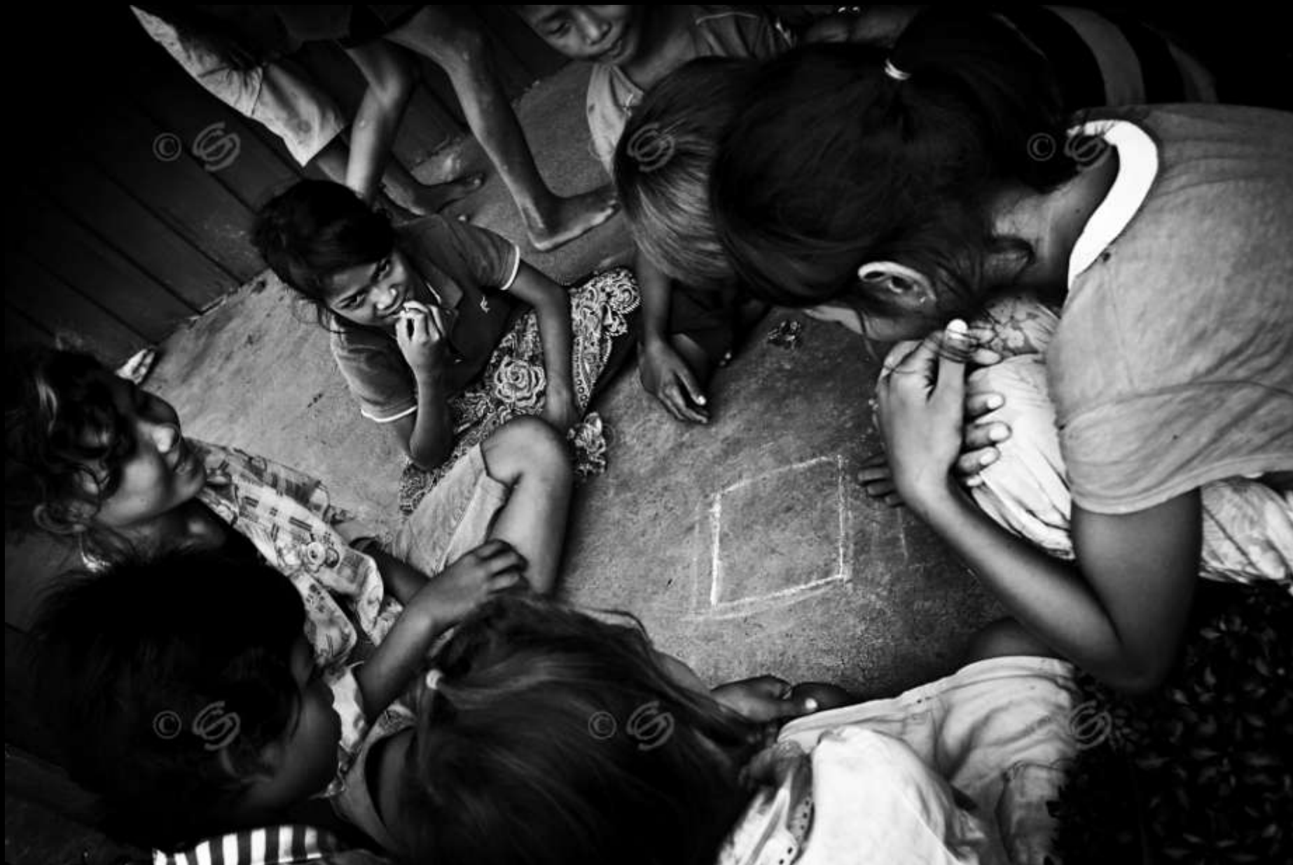
In the school courtyard, these children play writing on the floor with a piece of chalk.