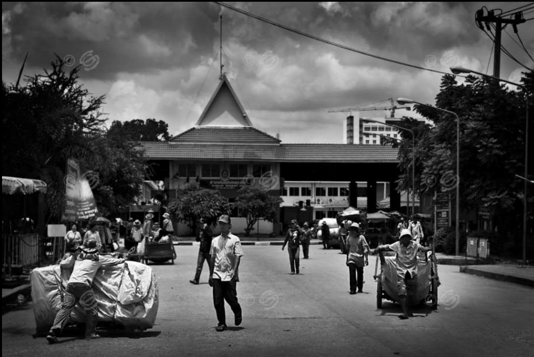
Aranyaprathet. Thai border – Cambodia. The narrow strip of land between the borders is the scenario of betting in the casinos and of the absolute poorness in the gardens and along the streets.