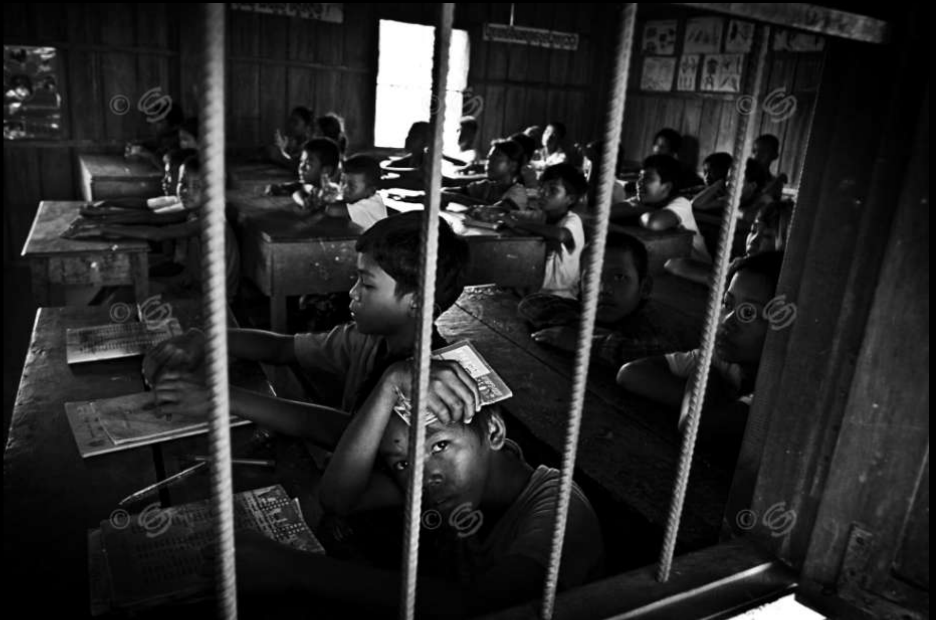
On the wooden benches of this school, the few books available are shared amongst the children. The available resources are small and often the projects are supported thanks to the contribution of foreign NGOs. In this case Mani Tese, an Italian NGO, has given an important contribution.