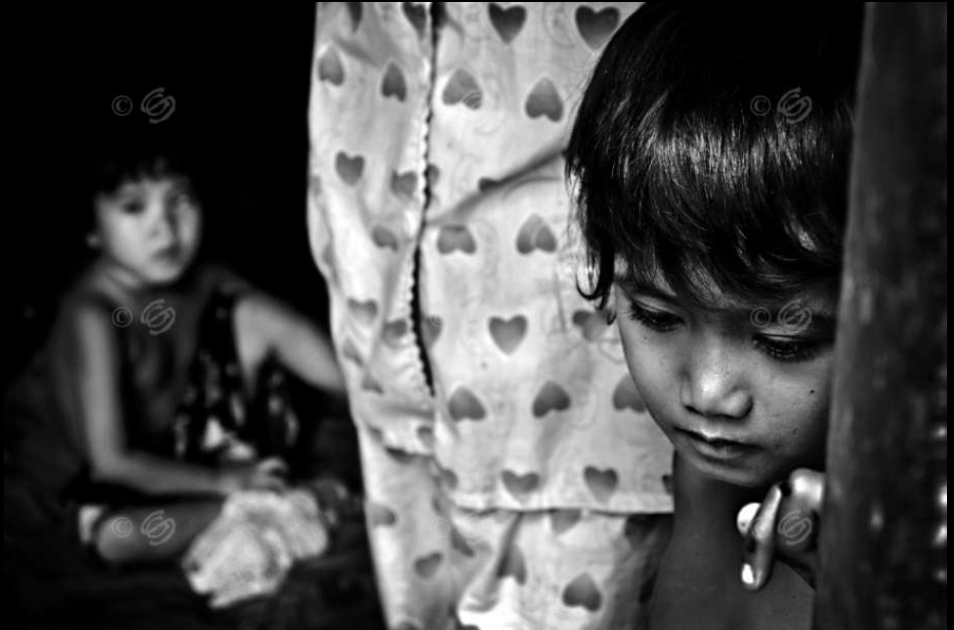
Used to look downward as it there was no sky to hold on to, this child listens to the Damnok Toek operators telling him about their school programs.