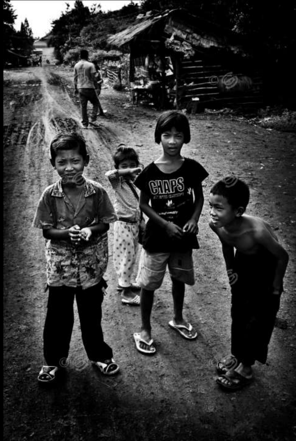
Nearly as lost, many children in the Poipet countryside wander without any destination along the streets, as looking for an helpful hand.