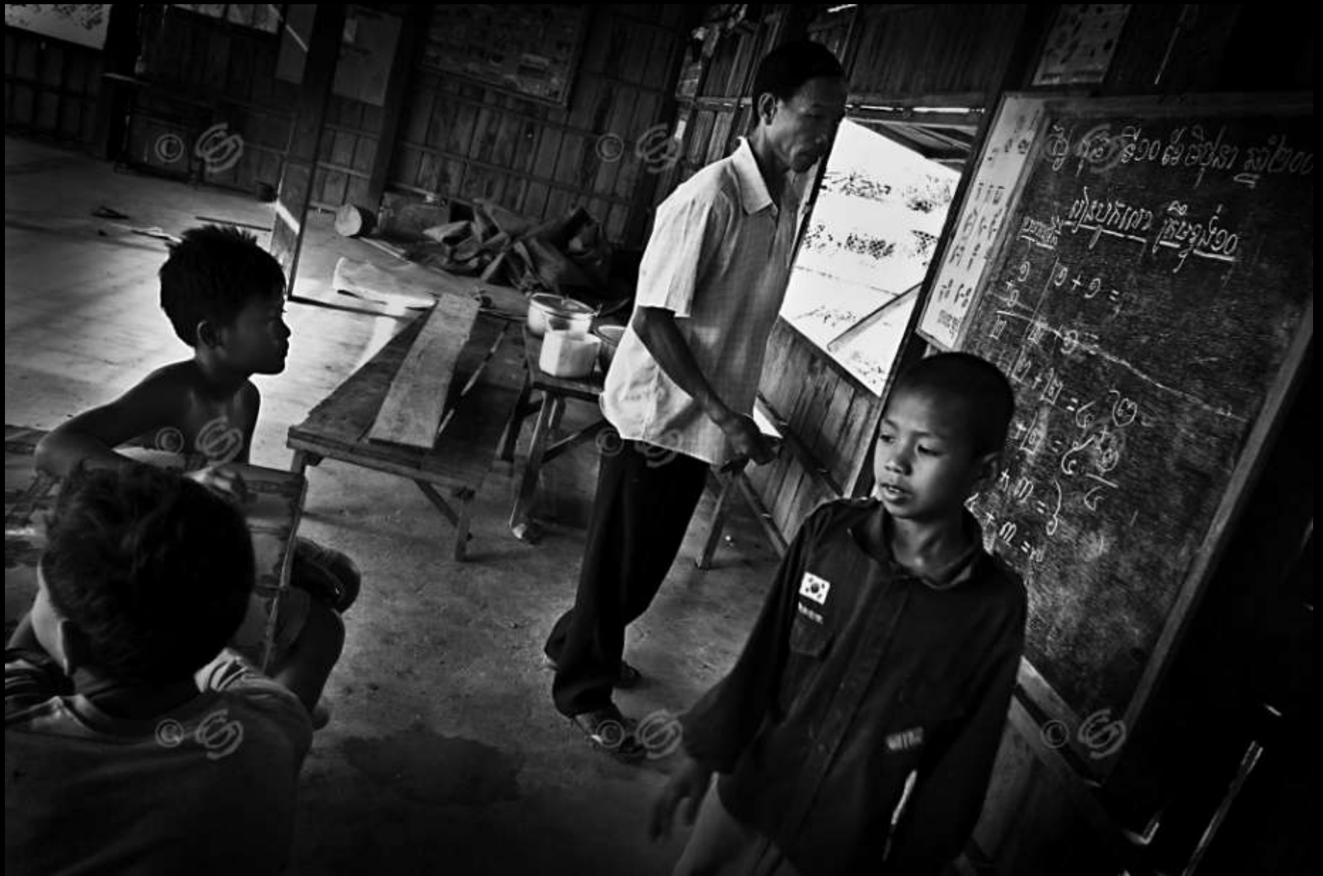
Math lesson. Every child follows a specific school program depending on his problems and origin.