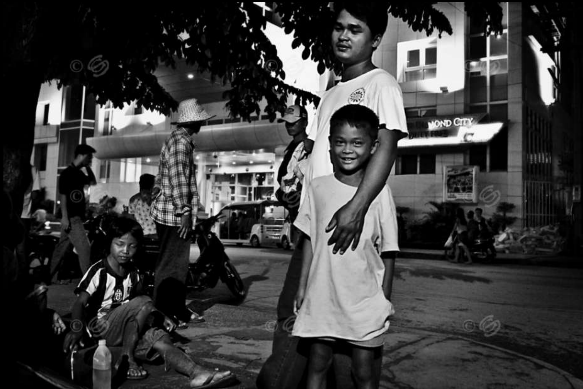
A Damnok Toek operators embraces a child whose parents beg money to procure the glue.