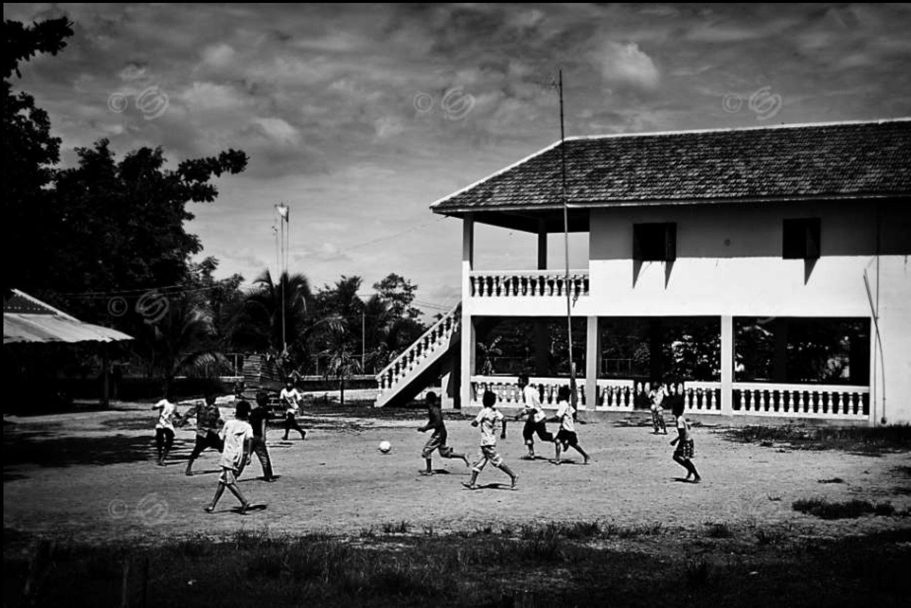
The school of Poipet has been built with the precious contribution of the Mani Tese NGO.