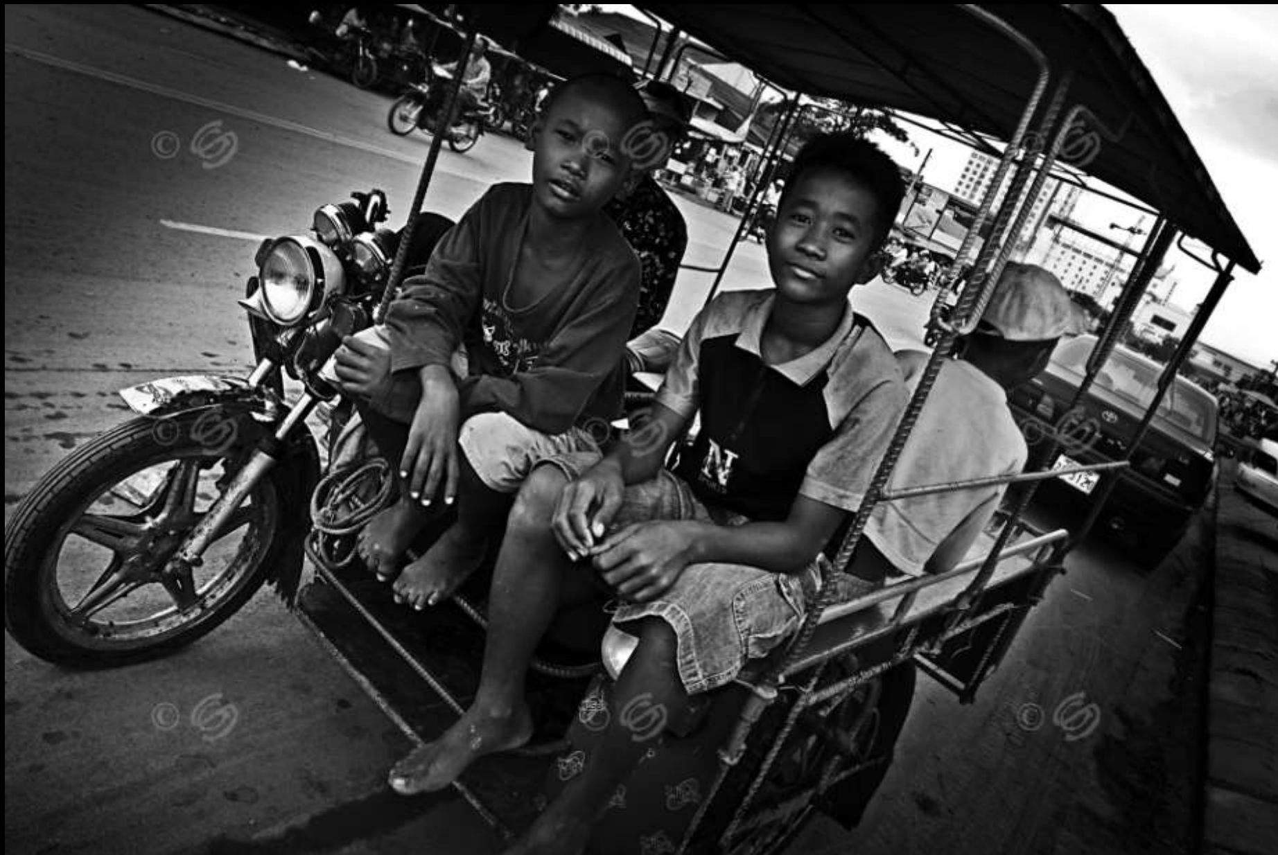
Thanks to the help of some taxi drivers and their moto-rickshaw, the children following the recovery program may be taken to school.