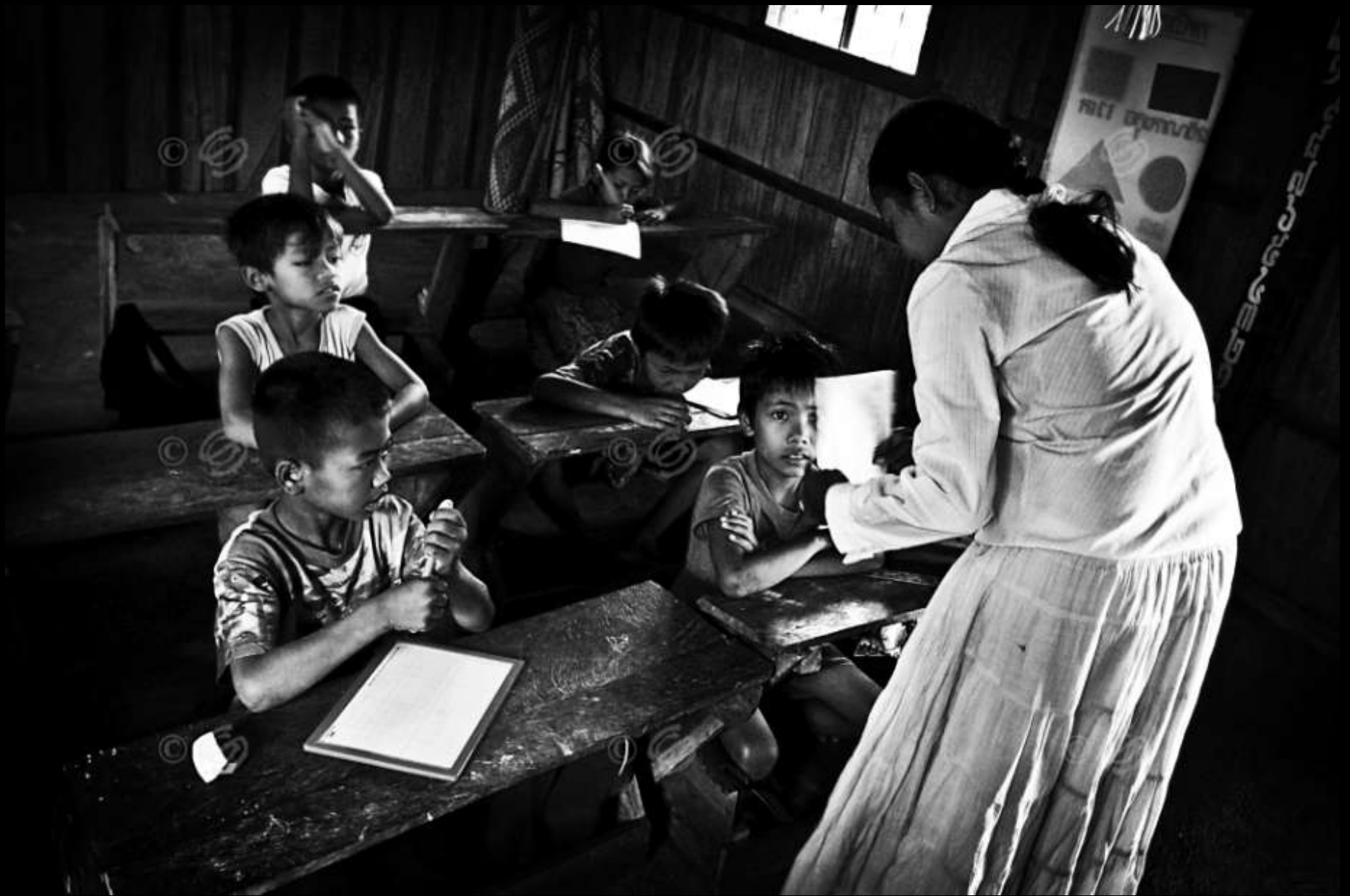
In this class including only six children, the teacher prepares the daily homework.